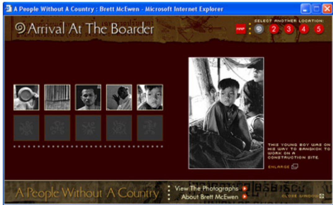
Figures 3 and 4: two views of the javascript window for 'A People Without a Country' (<a href="http://www.culturesontheedge.com/learn/hot_topics/spring_2001/index.html">http://www.culturesontheedge.com/learn/hot_topics/spring_2001/index.html</a>)

In this photo-essay, the photographs have been categorized and divided according to the refugee camps of the Karen People which the photographer visited in Thailand. The camps are numbered by the order he visited them. Once the audience enters the section belonging to each camp, they can see images of the people who live in that camp. The photographer's caption tells a short narrative about the life of each of the people who are shown in the images.