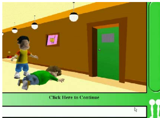
Figure 2. Screenshot from FearNot!