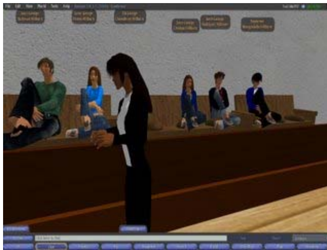
Figure 6. Of Mice and Men Mock Trials in Second Life