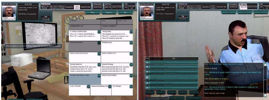
Figure 3. Screenshots from BiLAT