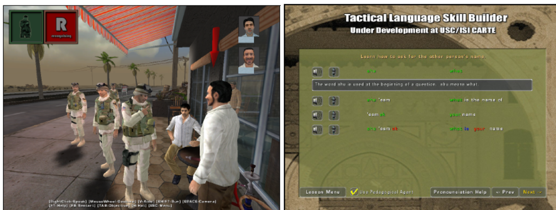
Figure 4. Screenshots from TLCTS

TLCTS (Tactical Language Training System) is another simulation that was developed at USC but at ISI (Information Sciences Institute) (Johnson et al, 2005). TLCTS uses game based technologies and design to support foreign language learning and cultural skills acquisition. The TLCTS includes two training courses: Tactical Levantine Arabic, for the Arabic dialect spoken in the Levant, and Tactical Iraqi, for Iraqi Arabic dialect. The experience takes the form of an interactive narrative constructed as a 3D game like environment (see Figure 4). The participant plays the role of a character, who is given several missions to solve. Solving the missions involve talking with characters in foreign language as well as showing specific cultural knowledge through the participant's choice of actions for his/her avatar. As the participant ventures through this world he is accompanied by an assistant non-player character who takes the role of a coach guiding the participant towards solving the mission's goal. The interface also includes several other