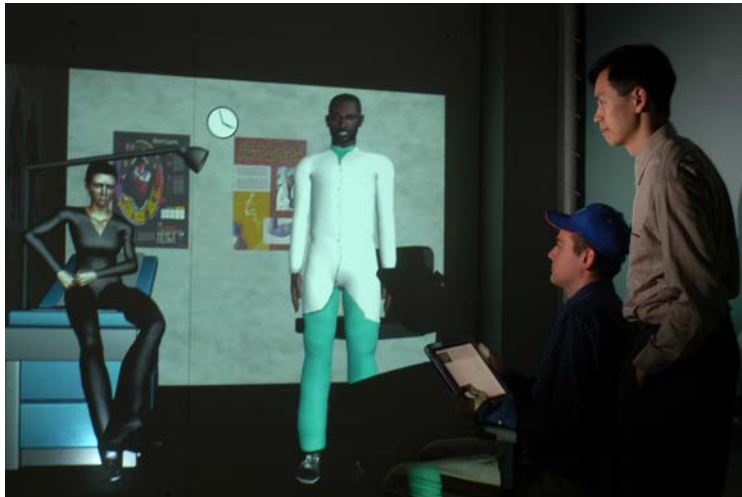
Figure 5. Screenshot from VOSCE

VOSCE (Virtual Objective Structured Clinical Examination) is a simulation that explores the use of virtual characters to help promote or strengthen patient-doctor communication skills. The system allows medical students to interview a virtual patient named Diana using speech and gestures, thus allowing for natural setting instead of using typing or menu choices (Johnsen et al., 2005). The system uses data projectors to present life-sized virtual characters to the medical student. Students speak to the virtual patient through a microphone. Thus the system includes speech recognition and an artificial intelligence system to match speech to appropriate responses. These responses have been created by some member of the teaching faculty at the University of Florida, Shands Hospitals. In addition to speech input, the system also tracks head and hand movements thus allows the virtual patient to react to gestures, such as pointing and hand shaking as well as eye contact.