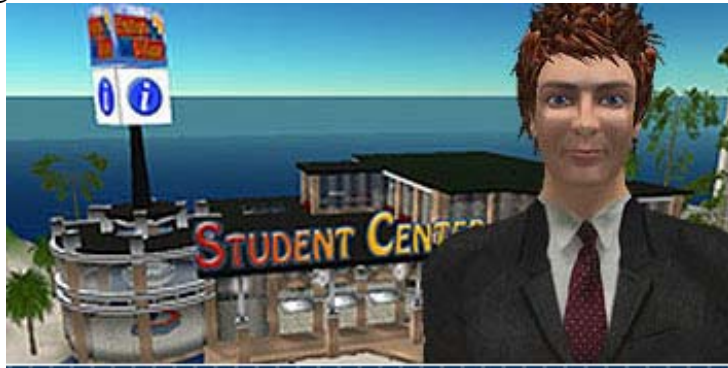
Figure 7. English as a Second Language in Second Life

English Village is a region in Second Life used to teach English as a Second Language. It has been used both in-world and at Mukogawa Women's University in Japan. The simulator includes a variety of environments as well as a “holodeck” that are used for immersive role play in classes. One of the ways in which students practice their English is through taking part in role-playing different scenarios using their avatars in the environment; these activities include asking for directions at a bus station or checking in at a hotel lobby.