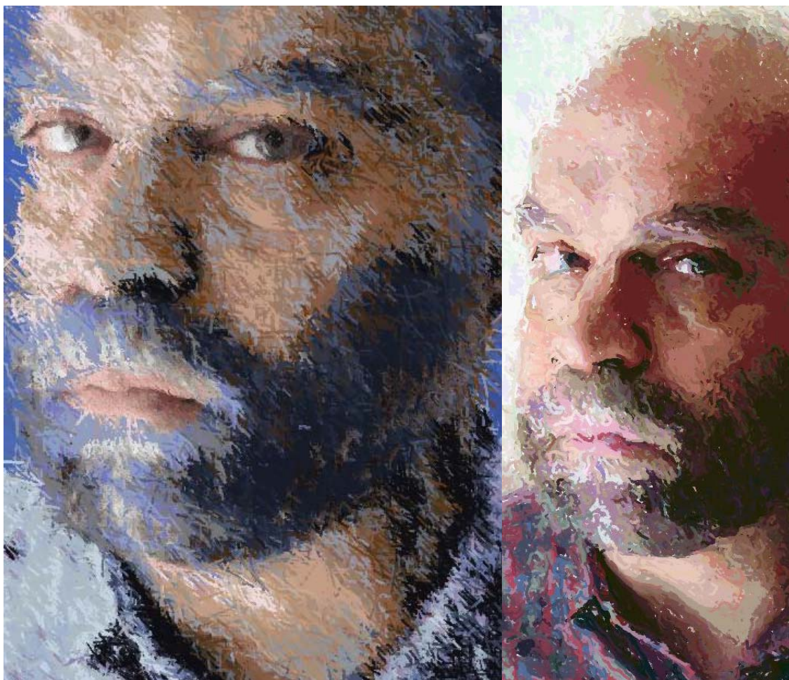
Fig. 2. From figure 1 input, the pastel (left) and the wet oil output (right) only have a handful of XML parameter differences including different palette and the pastel uses matte 1C) for a eyes/lips center of interest (images are cropped to show detail).

manipulation program created input data (matted areas) for centre of interest and facial recognition objects (figures 1C and 1B respectively) to understand and evaluate our low level process before we feel ready to bring in a specific high level recognition system. All parameters and configuration attributes are pixel resolution independent, allowing all global and local scaling to be rescaled by a few scale parameters. This allows us to render test output fast at small sizes without the need to change all but the scale parameters to render larger final paintings.