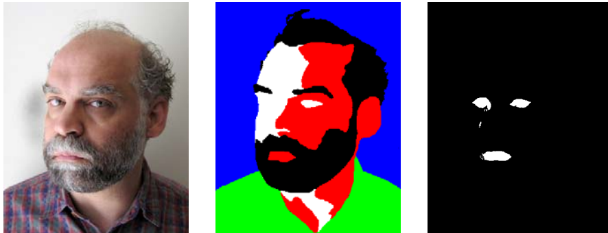
Fig. 1. Initial Image (A), Tone Map (B), Object/Focus Map (C).

dominant and sub-dominant value parameters also can rescale how the system analyzes/uses the source image. This is an example where painterly knowledge rules can supersede the information from the source sitter image (the sitter photograph) by filtering, emphasizing/de-emphasizing, and scaling input information as well as by other rule based means.