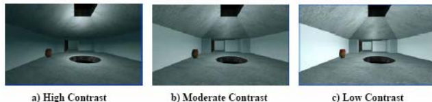
Fig. 3. Linearly increasing brightness contrast (where center of room is the focus)

Figure 3 and 4 show screenshots where we fabricated an arousal signal; we used pattern 1 and 3 from the list above, results of which are displayed in figures 3 and 4, respectively. Figure 3 shows a simple 3D room rendered using WildTangent, where we linearly varied brightness contrast between the focal point (center of the room) and surrounding areas. The figure shows three screenshots of the room taken at different points during the transition. Figure 4 shows a first person shooter rendered using Unreal Tournament, where we mapped saturation level to the number of enemies in the scene (i.e. if number of enemies are high the saturation is high and vice versa). The figure shows four screenshots taken at different points within the game.