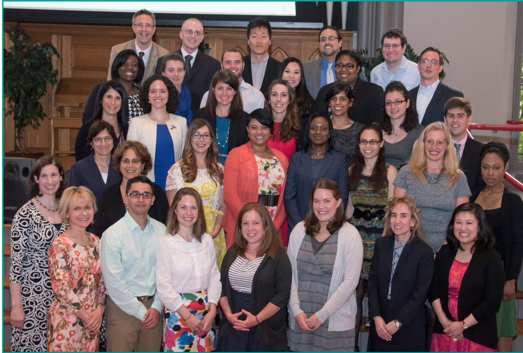
2015 Health Law Certificate Graduates and L&HCP Faculty

On May 14, Law & Health Care Program (L&HCP) faculty celebrated the graduation of 30 students who earned the health law certificate. The breakfast celebration was held in the law school's Westminster Hall with over 90 people in attendance, including family and friends of the graduates. This year marks the 30 th anniversary of the Law & Health Care Program and the 18th year that the program has been awarding certificates to students who complete the concentration in health law. This concentration requires that the students take 17 of their 85 law school credits in health law, participate in a health law clinic or externship, and write a scholarly paper on a health law topic.