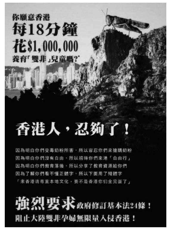
Fig. 1: Anti-Locust Advertisement, 苹果日报 (Apple Daily), Feb. 1, 2012

The Old Testament's Book of Joel (1:6-16) depicts locust swarms bringing ruin to ancient Israel and foretelling the "End of Days" for humanity. Hong Kong's "localists" (本土派) depict mainlanders as locusts ruining the territory and bringing an end to a vaunted way of life. In early 2012, a Hong Kong newspaper published a full-page advertisement, in which a locust perched high on top of a hill overlooking Hong Kong's landmark Victoria Harbor. The central message was that "Hong Kong people have had enough!" (Fig.1).