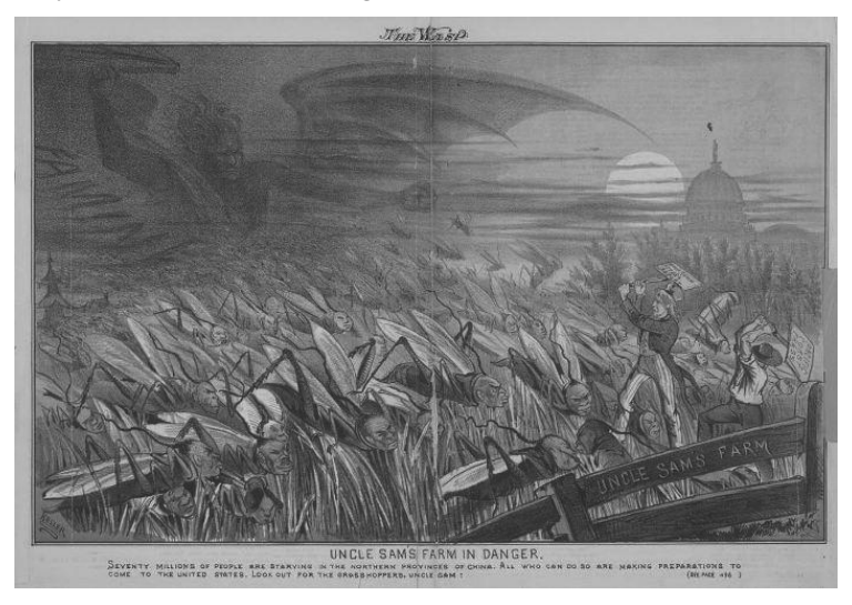
Fig. 4: Caption: "Seventy millions of people are starving in the northern provinces of China. All who can do so are making preparations to come to the United States. Look out for the grasshoppers, Uncle Sam."

the slanty-eyed race taking over the world."<sup>197</sup> The Chinese have often been depicted as locusts by anti-immigrant and other racist forces. During the Chinese Exclusion Act and anti-Chinese pogroms in North America, a notorious 1878 magazine illustration by George F. Keller depicted swarms of "Chinese locusts," with insect bodies and "Asian faces," perched for destruction and descending on the US ("Uncle Sam's Farm") (Fig. 4)"<sup>199</sup> The artist had mastered classic invasion imagery and animal symbolism to devastating effect.