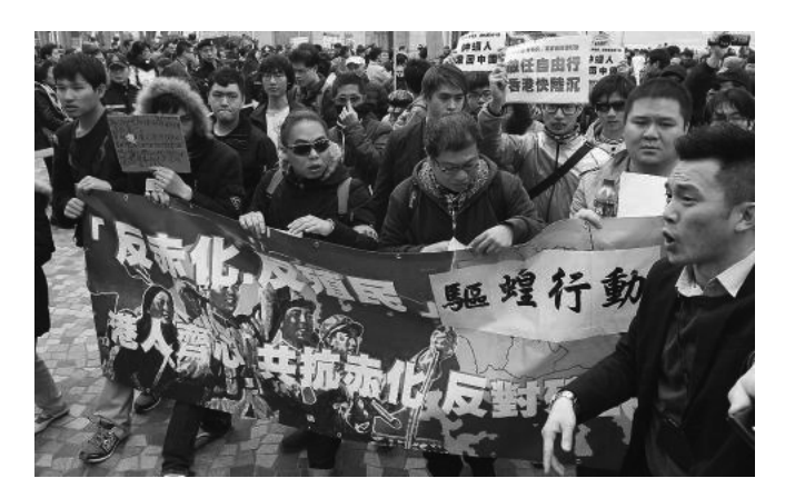
Fig. 3: "Oppose Reddening; Oppose Colonialization"; "Hong Kong People Work Together to Resist Communist Reddening, Oppose Colonialization: Drive out Locusts Movement."

high school member of the Communist Youth League in Guangzhou. <sup>71</sup> Even the local leader of the winning slate was Red-baited because his grandfather was a CCP member in Beijing. <sup>72</sup> Most voting undergraduates "[i]n a referendum sparked by a groundswell of support for the so-called localist movement" also voted for the HKUSU to withdraw from the Hong Kong Federation of Students because the "Hong Kong independence [movement] believes [that] the federation's core mission to 'build a democratic China' diminishes its ability to represent the interests of the city." <sup>73</sup> In 2015, the HKFS decided to not participate in the annual rally to mark the June 4<sup>th</sup> 1989 suppression, a decision [that] shows that "the federation has compromised with the localism campaign." <sup>74</sup> Indeed, some student leaders questioned whether Hong Kong people are Chinese. <sup>75</sup>