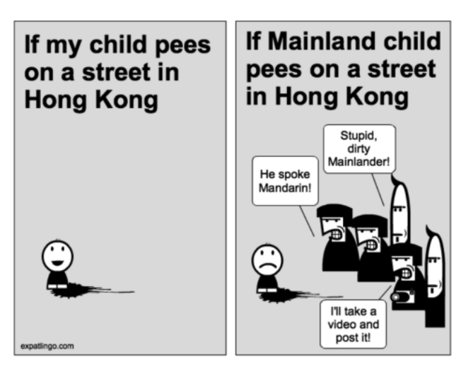
Fig. 5: British newspaper commentator's view of Hong Kong urination controversy

A British newspaper columnist wrote with amazement at the uproar in Hong Kong over mainland small children relieving themselves. She and other parents had on occasion had no other choice but to have their small children urinate publicly and without repercussion; "but a woman who let[s] her two-year-old have a pee in one of the world's biggest shopping districts in Hong Kong has caused a huge culture clash and divided China."<sup>357</sup>