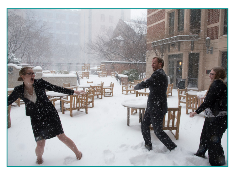
The University of California Hastings College of Law Team make the most of a snowy day