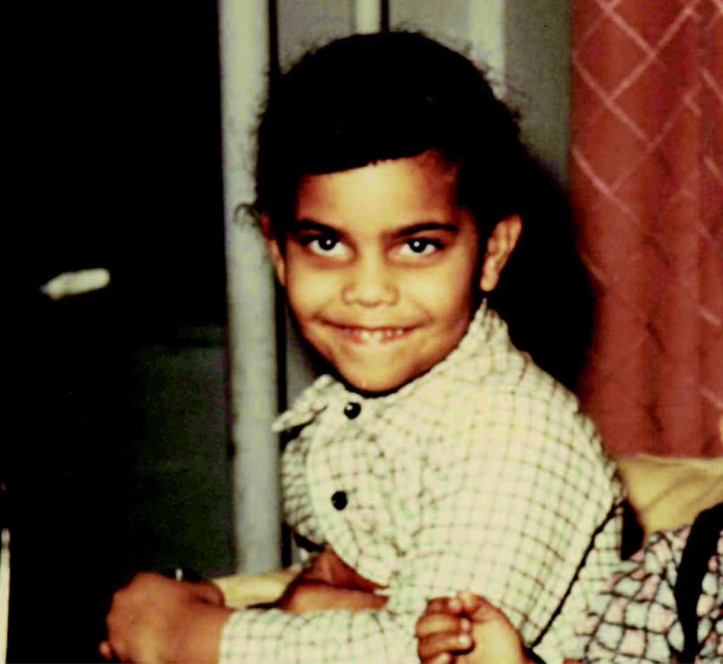
childhood in Passaic, NJ