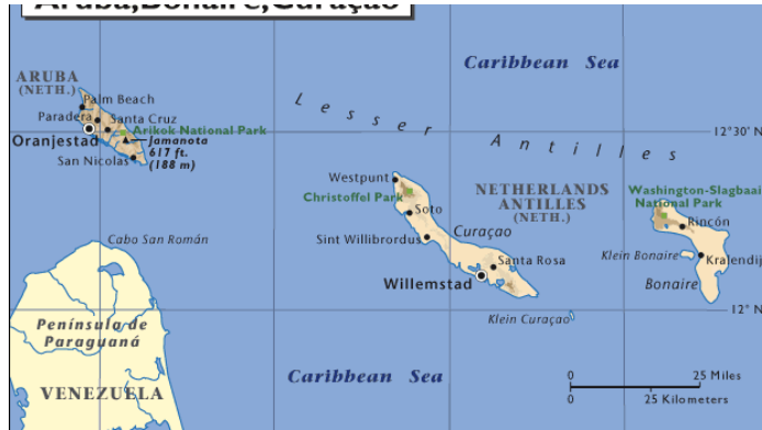
Place of Capture: