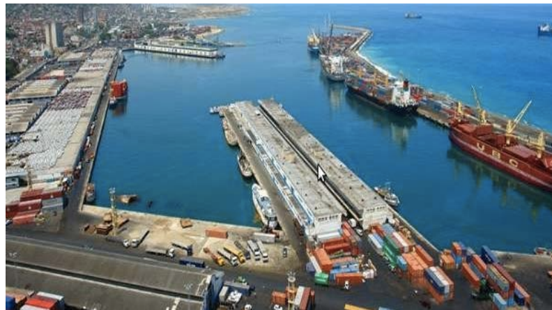
Present Day Lagaira: