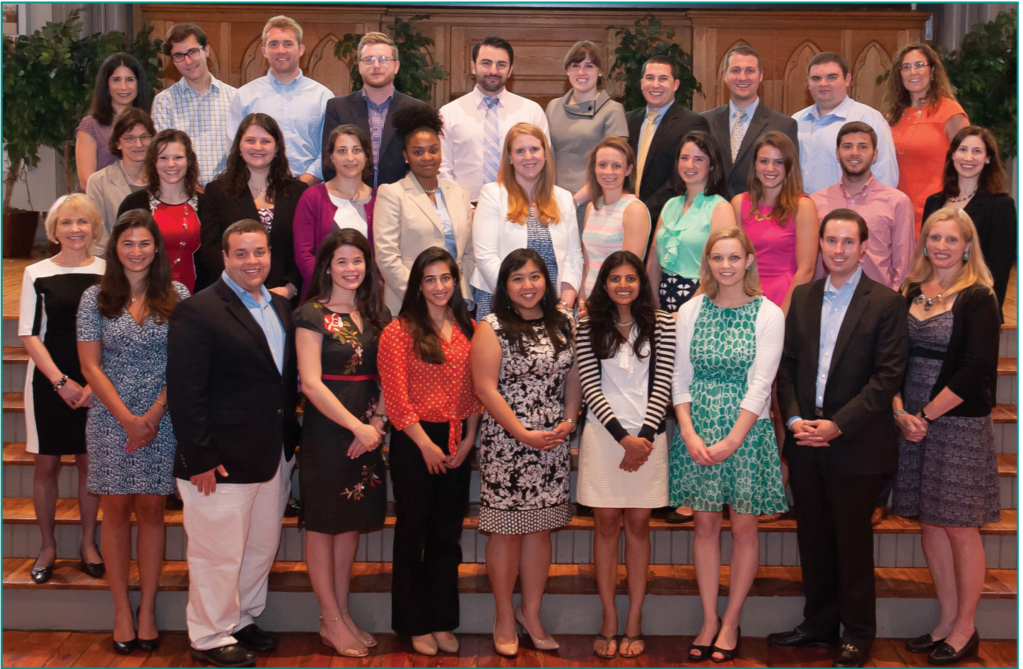
2014 Health Law Certificate Graduates