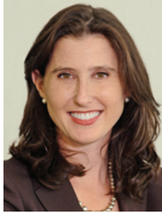
ABBE GLUCK PROFESSOR, YALE LAW SCHOOL

The Challenges of the ACA in the Courts, the Congress and the States: The Legal-Political Twists and Turns of the Most Controversial Statute in Modern Times