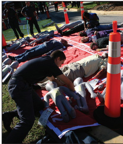
Mock drill simulating a mass casualty incident.

Afterwards, a countywide planning meeting was held to finalize the roles and responsibilities of the agencies.