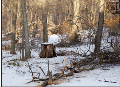
Winter storm tree damage in Maryland.

The 2013-14 winter season dealt parts of Maryland more snow in just the first few storms than the entire previous winter. As ice and snow caused travel headaches and power outages, and an active-shooter event impacted a local shopping mall, CHHS staffers who work directly with local and state emergency management agencies supported several Emergency Operation Center (EOC) activations this winter.