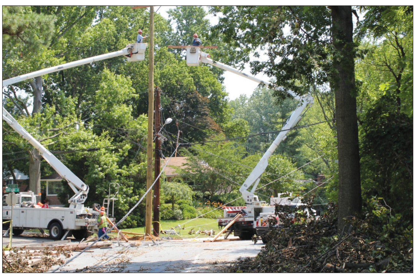
PEPCO crews hard at work to restore power to customers after Hurricane Sandy downed many trees and power lines in the DC, Maryland, and Virginia area.