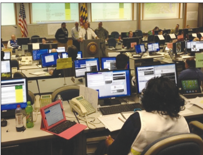
On December 19, 2012, the Maryland State EOC was activated in conjunction with the National Capital Region Functional Exercise.