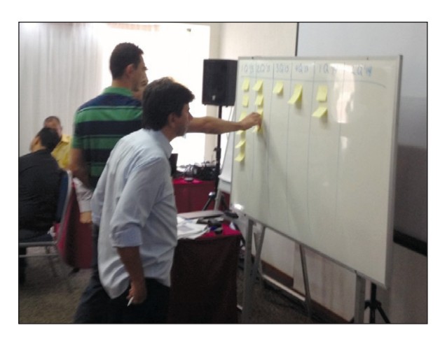
Brazilian government officials plan out their exercise and training strategy leading up to the 2014 World Cup.

CHHS has conducted trainings and exercises at all levels of government. Working with clients such as the U.S. Department of State, the National Capital Region, and many Maryland counties, the CHHS Exercise and Training Team has helped clients identify gaps, suggested policy improvements, improved response knowledge for employees and first responders, and assisted in developing robust training and exercise plans. Recent projects from the exercise and training team include: