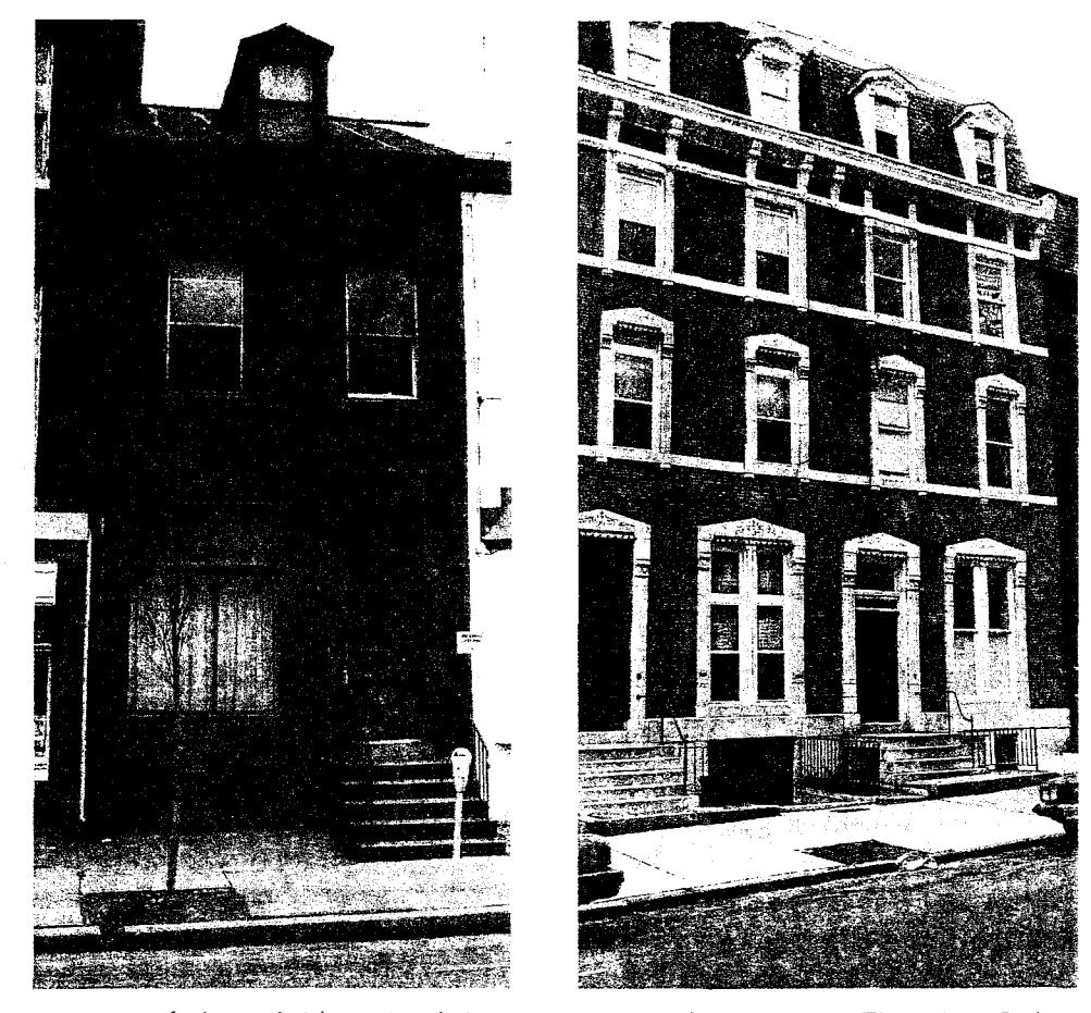
FIGURE 2. Left, 410, and right, 1513 Park Avenue as they appeared in recent years.