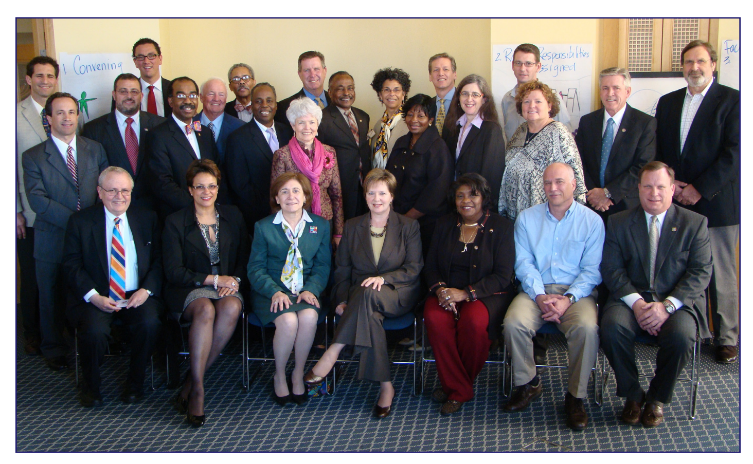
The Public Policy Conflict Resolution Fellows Program Class of 2010 and hosts.

The Fellows found that being a part of the program provided them with the opportunity to gain a unique understanding of conflict resolution processes, to interact with other Maryland leaders, and to spend time "thinking outside of the box." The Program encourages Fellows to explore and discuss some of the real public policy challenges being faced in Maryland. The recent graduates have already begun to identify potential opportunities for collaboration including legislative efforts, cooperation among non-profits, outreach efforts on public health issues, and involvement of community members in decisions that impact the community.