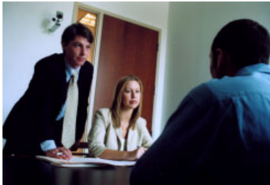
Student attorneys consult with a client.

Students have also represented caregivers regarding issues of medication compliance. The Clinic is working with providers to develop new models to address the question of medical neglect in a way that fosters medication compliance and prevents removal of the child from the home. Students also work directly with adolescents with HIV to help them hold the foster care system accountable to meet their needs. They advise the youth and health care providers on legal issues in medical decision-making for teenage patients who are HIV+ or at risk for HIV, including for example questions of consent to enrollment in clinical trials. Clinic service is integrated and holistic, providing interdisciplinary expertise to identify and resolve problems, and serving the complete grandparent family unit with legal, social work and medical support services.