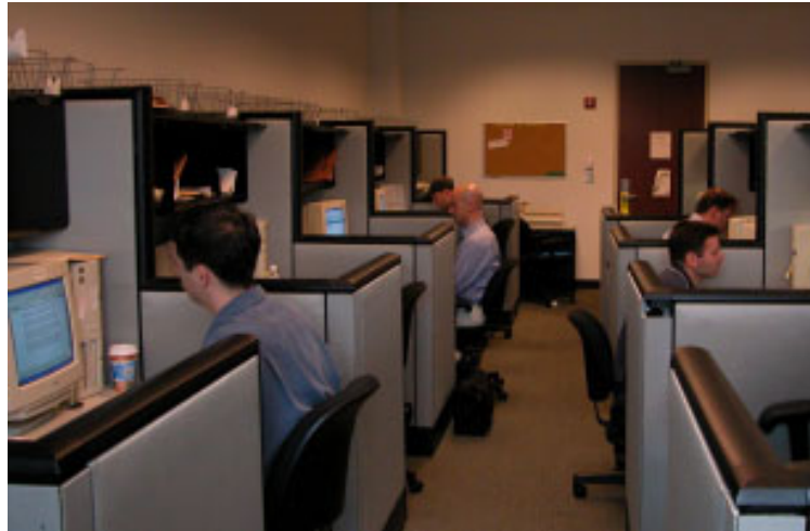
Clinic students at work in one of the Law School's six practice rooms.

of urban brownfields; the prevention and remediation of nutrient loading in the Chesapeake Bay; expansion of community right-to-know laws;