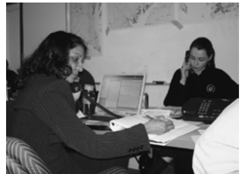
CHHS Attorneys participate in Emergency Preparedness Exercise