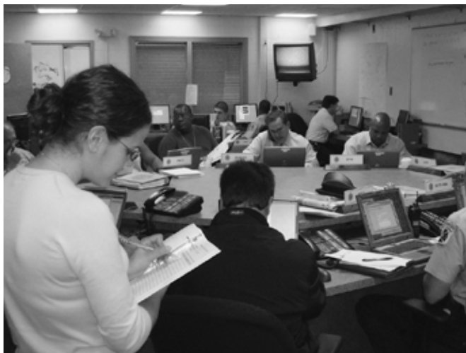
A CHHS staff attorney evaluates a simulated hurricane exercise in Baltimore City

Specifically in the area of public health preparedness, CHHS staff members are engaged in COOP planning for the Baltimore City Health Department. This is an especially challenging COOP project because a health depart-