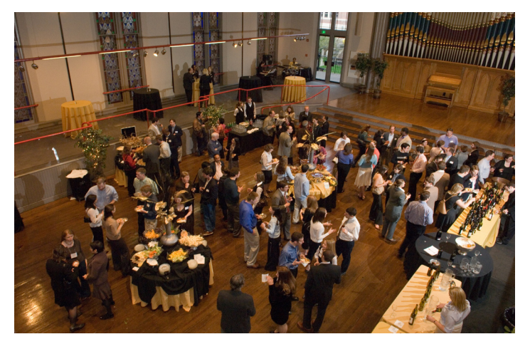
About 200 guests attended the celebration!