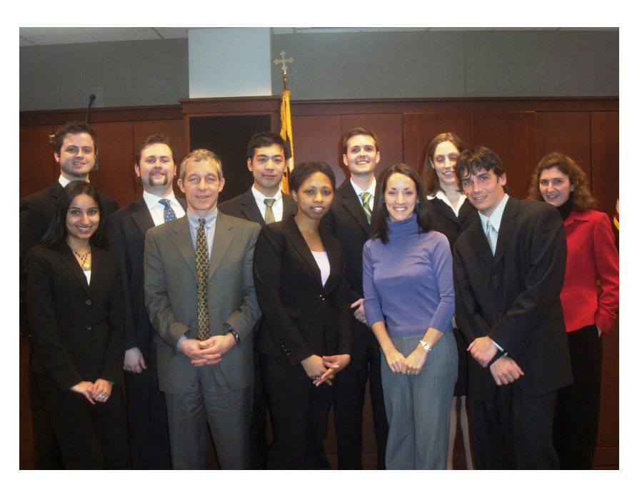
Students participate in an environmental clinic mock trial with Mark Gallagher, a senior attorney with the Environment and Natural Resource Division of the U.S. Department of Justice, serving as the judge.

The Clinic's comments included recommendations for three areas: (1) in-depth updates to the CPP's discussion of the CPP's goals and TMDL development and implementation; (2) general updates to core elements of the CPP covering topics such as intergovernmental cooperation, construction needs for wastewater treatment, and public participation; and (3) presenting the revised