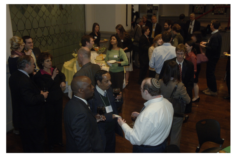
Participants mingle at the reception on Thursday.

gestions on legal materials from their countries that would be good candidates for inclusion in "Global Environmental Law."