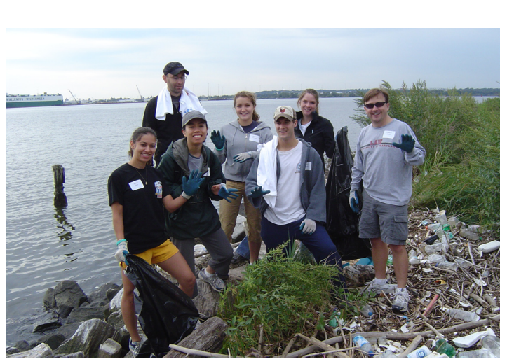
Students participate in the beach cleanup of the Chesapeake Bay.