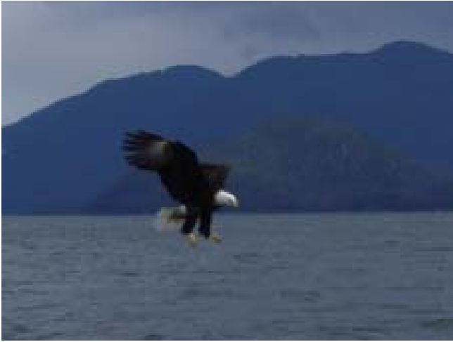
A bald eagle fishing in Favorite Channel near Juneau.

camera in a waterproof bag. I acquired this knowledge at the cost of my first camera, which did not survive my unexpected swim in a glacial stream. I was more pleased to gain a basic understanding of photographic composition and a working knowledge of how to operate a camera. I also became more patient, sometimes waiting hours for Juneau's seemingly ever-present clouds and fog to clear, or waiting for an animal to move so that I could take a better picture.