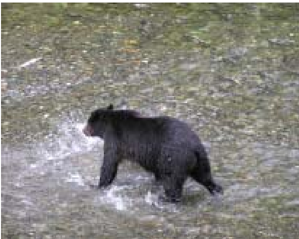
A bear fishing for salmon at Pack Creek.

Most importantly, my photographs of these experiences provide me with a constant reminder that there is much work that needs to be done to protect our environment. The pictures of glacial valleys, and the forests that are beginning to take hold on the recently barren glacial plain stand as a testament to the fact that global warming is causing all but a few of Southeast Alaska's glaciers to recede at a frightening pace. The pictures of salmon and the animals that depend on salmon, serve as a reminder that the staple