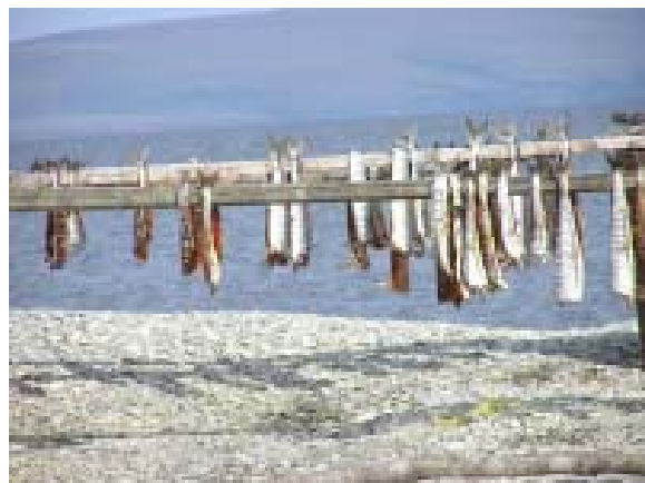
Salmon drying in Teller.

While I like to think that I experienced some success as a photographer, the majority of any success is due to two factors that are entirely unrelated to any skill on my part. First, I used a digital camera to take almost all of my pictures, which gave me the ability to immediately