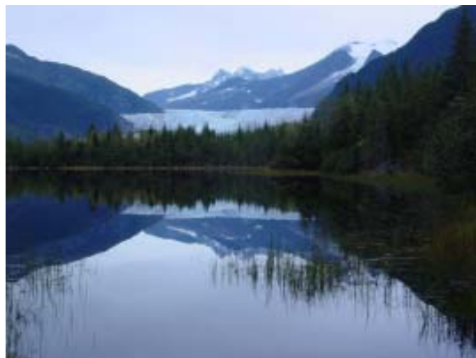
Juneau's often photographed Mendenhall Glacier is rarely seen from this angle.

Juneau sits on Gastineau Channel, which is part of Southeast Alaska's Inside Passage, and is surrounded by a series of dramatic 3,000 to 4,000 foot mountains. In addition to these features, the area around Juneau is full of valleys, glaciers, and rivers that provide spectacular subjects. It is almost impossible to avoid bald eagles, as the roughly 20,000 bald eagles in southeast Alaska are drawn to the salmon that spawn in Juneau's streams every spring and summer. It is also relatively easy to encounter harbor seals, porcupines, beavers, and both brown and black bears in the area around Juneau. One of my most enjoyable experiences was a trip to the Pack Creek on Admiralty Island, which is home to the largest concentration of brown bears in North America. While there, I was fortunate to observe and photograph several bears feeding on a late salmon run. While my Alaskan experience was dominated by the rainforests of southeast Alaska, I was also fortunate to experience the unique beauty of Denali National Park during the summer solstice, the tundra outside of Nome, and the marine life of the Seward Peninsula.