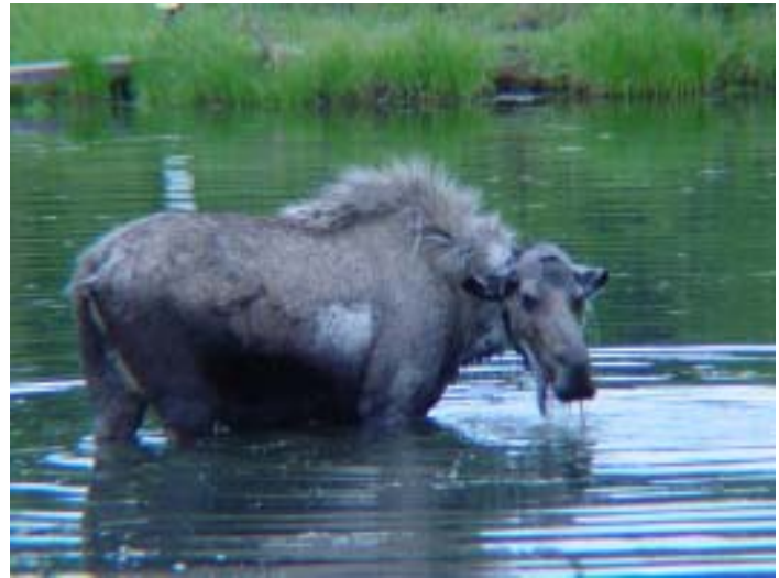
A moose enjoying a quick bite at Denali National Park.

fish of Southeast Alaska must be managed sustainably in the face of threats posed by fish farms, mining, and possibly salmon hatcheries. I also appreciate my interaction with, and pictures of, the people of Alaska.