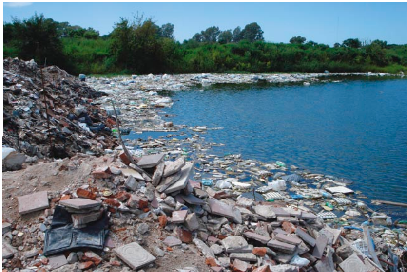
City authorized dumping site in the Chacras barrio.

The consequences of unsanitary living conditions are felt disproportionately by the poor. They live near polluted waterways and toxins, suffering poor health as result of these living conditions. Thus, the linking of these debates is natural for the marginalized in society. At the same time, judicial systems are generally hesitant to identify or define new obligations for the state that would result in the enforcement of environmental and human rights.