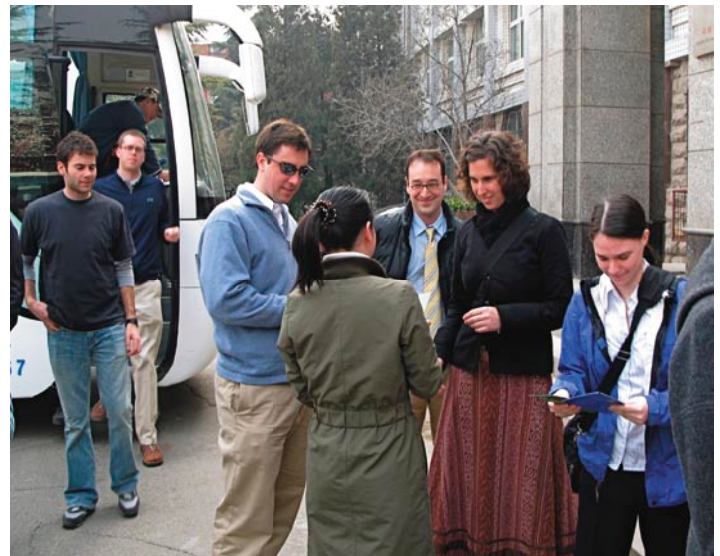
Maryland Law students are greeted by Chinese environmental law students as they arrive at the China University of Political Science and Law (CUPL)

I am having the Chinese Environmental Law students do the same assignment I give my Maryland students – break up into small groups and choose an environmental topic to be the subject of a short film. My Chinese students have enthusiastically embraced this project and are working on making films on a variety of environmental topics including air pollution in China, the environmental impact of disposable chopsticks, and China's ban on the distribution of free