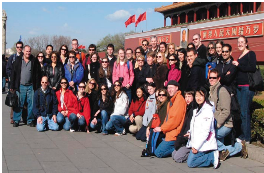
Students, faculty, alumni and friends gather together before touring the Forbidden City in Beijing.

The trip combined visits to the top tourist sites in three Chinese cities — Beijing, X'ian, and Shanghai — with meetings with Chinese students, environmental groups, and government officials. In the Beijing area the group visited the Forbidden City, the Summer Palace, the Great Wall, and the Temple of Heaven. They toured a hutong and had dinner with Chinese host families living there.