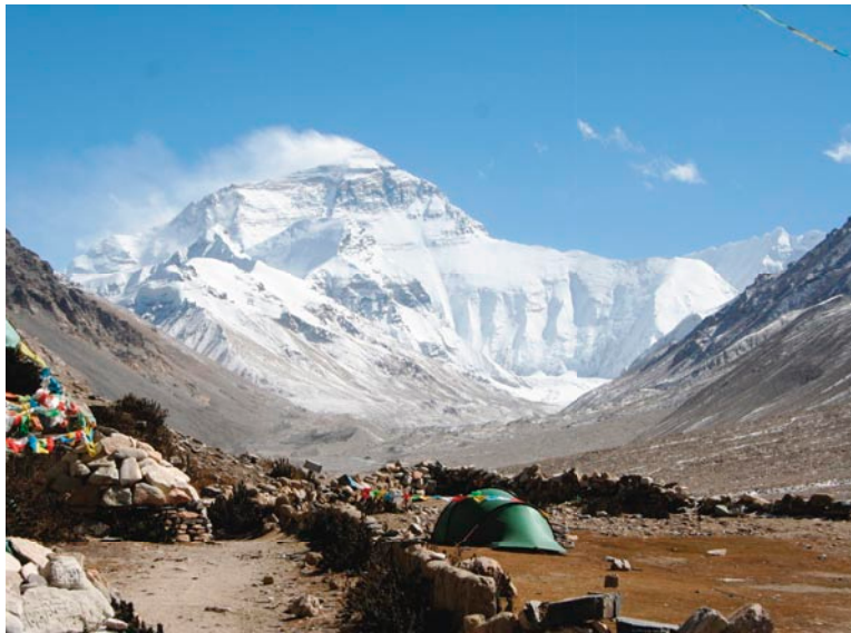
North face of Mt. Everest from Rongbo Monastery.

On my way to New Delhi in December I stopped in