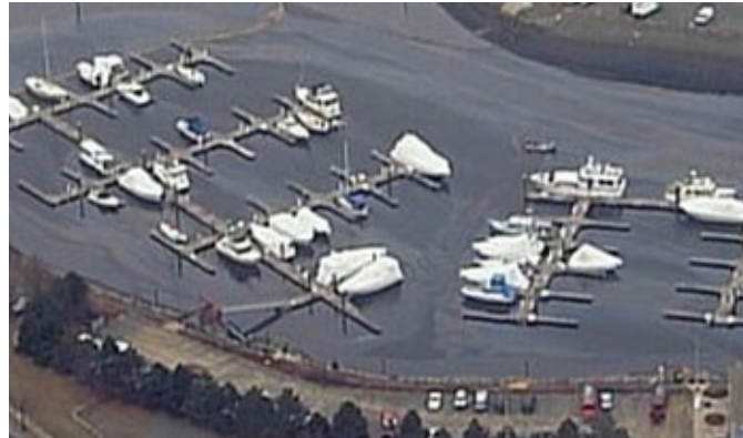
Aerial view of Everett oil spill

Notes Russ, "I feel strongly that [Maryland's] environmental law program gave me the tools I needed to make a difference. I am grateful for the education and experiences I gained there."