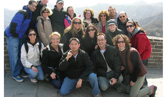
This could be you: Group from 2008 trip enjoys time at Great Wall

The cost of the trip is an incredible deal because it includes roundtrip airfare, all transportation within China, all hotels, and most meals. Also, we expect to get a rebate of approximately $100 per person upon returning from China. During these troubling economic times, it may be comforting to read about the job-loss money-back guarantee policy that our travel agency, Education First, provides. You can view it at http://student-travel.eftours.com/landing/pages/guarantee.aspx .