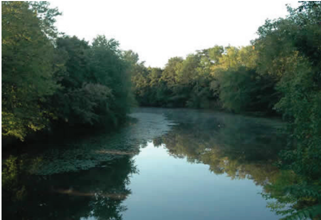
The scenic Mystic River