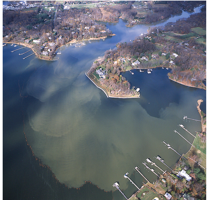
Clearly visible sediment in Church Creek and South River

"Sediment-laden runoff from construction sites can drastically alter the ability of a stream to support life. This mud prevents sunlight from reaching diminishing submerged aquatic grasses, smothers oyster reefs, and severely stresses fish," he says.