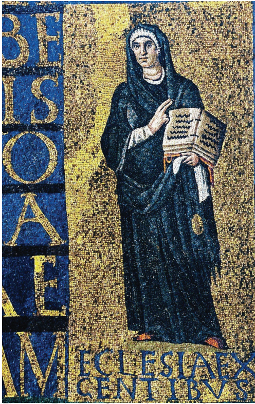
Figure 1: Ecclesia ex Circumcisione , 5th Century, Santa Sabina, tesserae