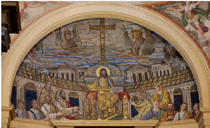
Figure 6: Apsidal Mosaic , 5th Century, Santa Pudenziana, tesserae