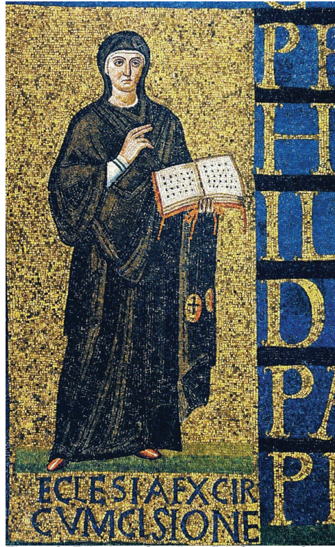
Figure 2: Ecclesia ex Gentibus , 5th Century, Santa Sabina, tesserae