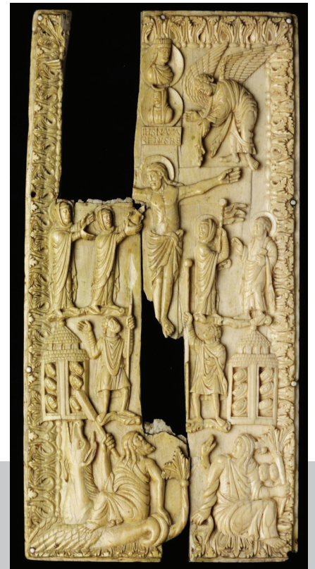
Figure 3: The Crucifixion c. 860 C.E., Ivory