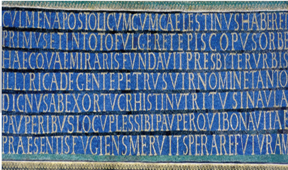
Figure 4: 5th Century, Santa Sabina, tesserae