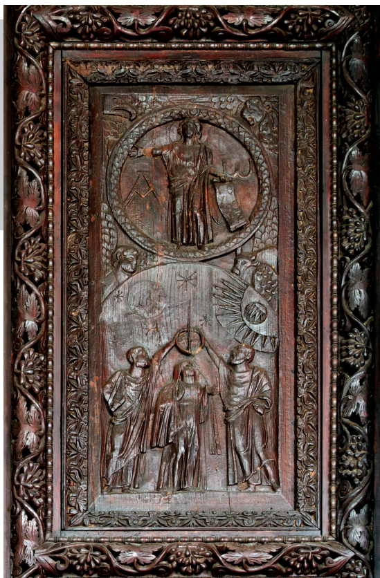
Figure 9: Parusia door panel , 5th century, Santa Sabina, wood