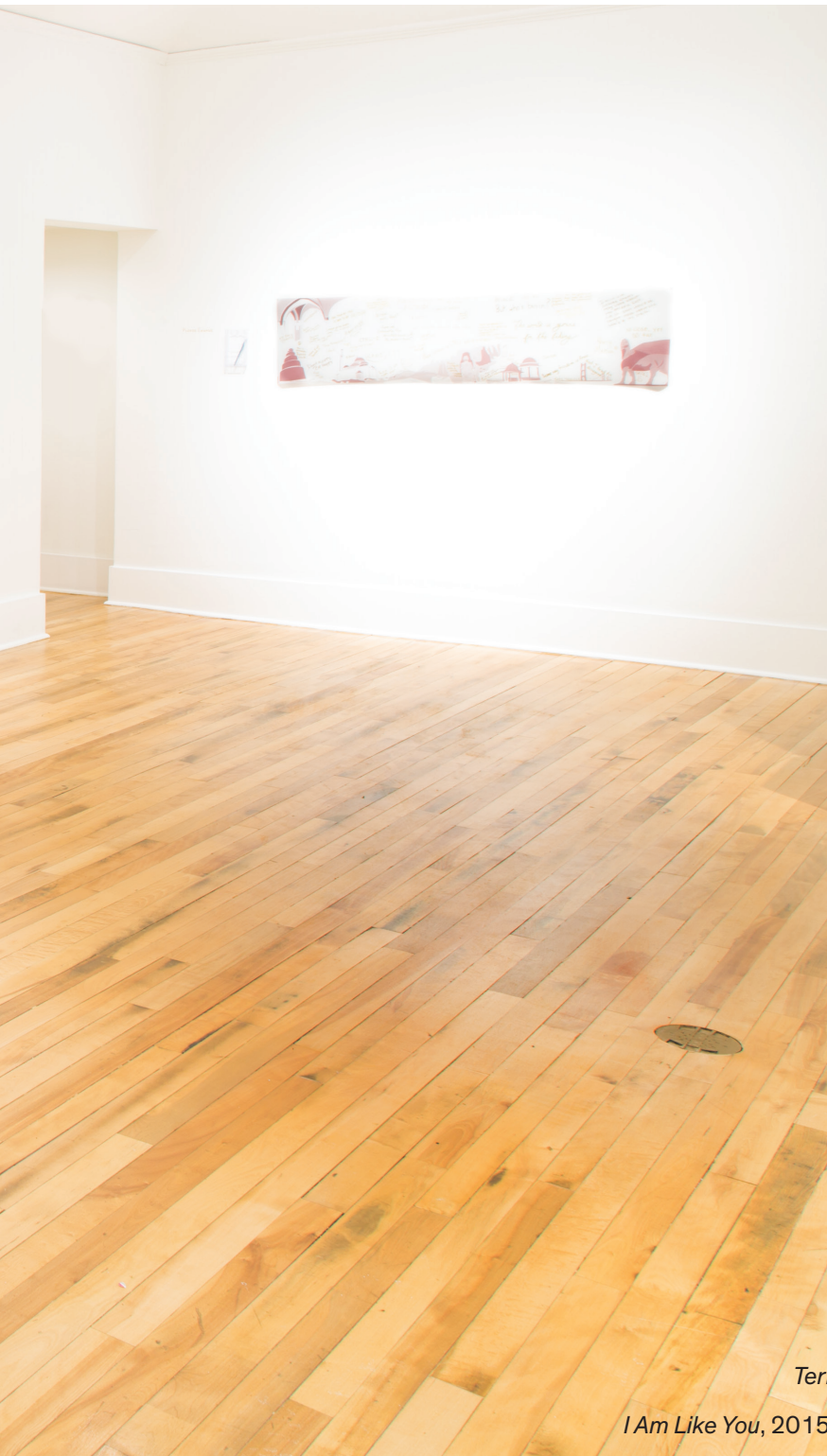
Terrain Model , 2016, Mixed media sculpture, 4 ft x 8 ft