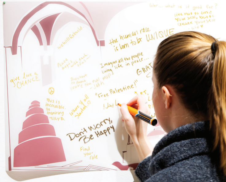
Please Engage, (Detail), 18 in x 72 in