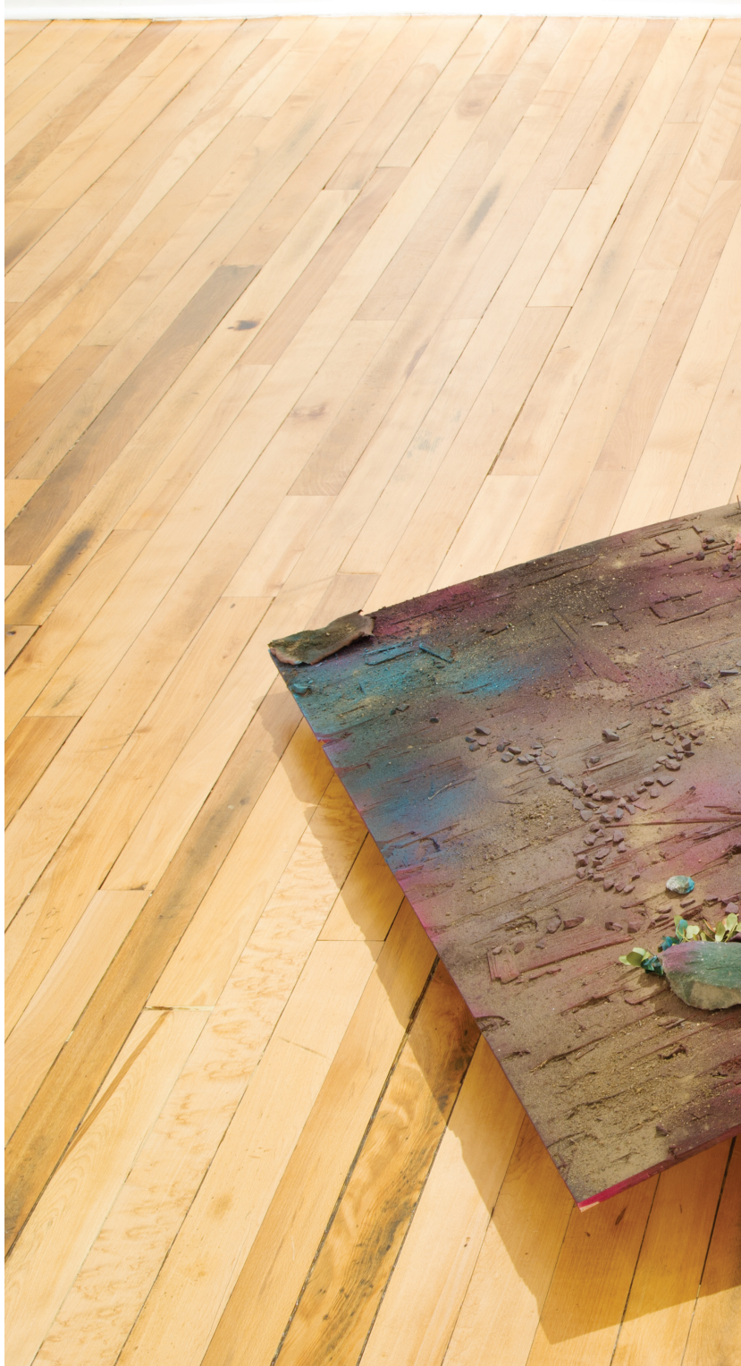
Terrain Model , 2016, Mixed media sculpture, 4 ft x 8 ft