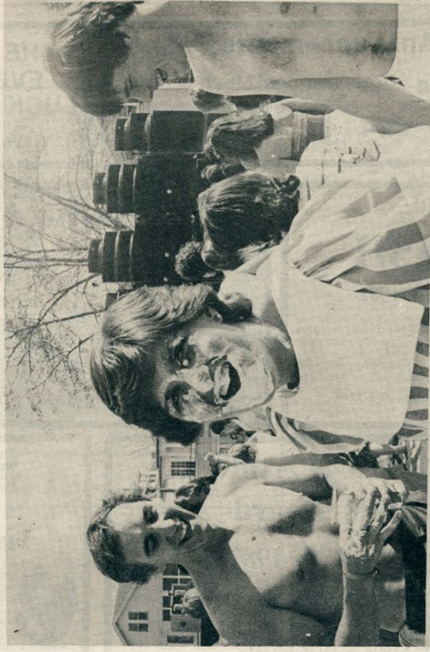
Spring Fling '82 — A pie in the eye!