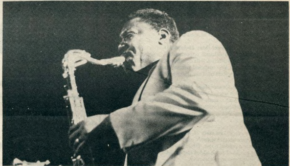
"The Big Man" doing what he does best.