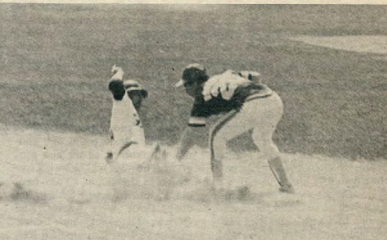
Not able to get under the tag this time, the Friars still managed dual wins over Iona on Sunday.