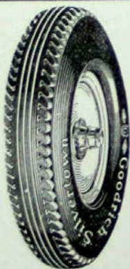
GOODRICH Phone WE. 5142

There is wealth in China, and there is luxury, but the majority who pay for it neither see nor enjoy it. If 70 per cent of the Changsha population are below the economic level of the average American who can send his children to school, it is safe to say that this 70 per cent represents the usual status of the average Chinese in China. There are gradations of poverty even far below this, and it is no wonder that the hopeless thousands are willing to flock to a banner that holds out to them, though falsely, some slight hope of change. And yet every farmer or peasant is not a Communist. On a mountainside near Changsha dwell in squalor 10,000 farmers and