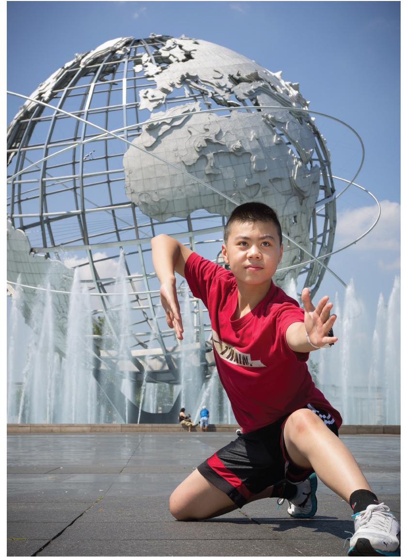
Steven , archival inkjet print, 24" x 36", 2014