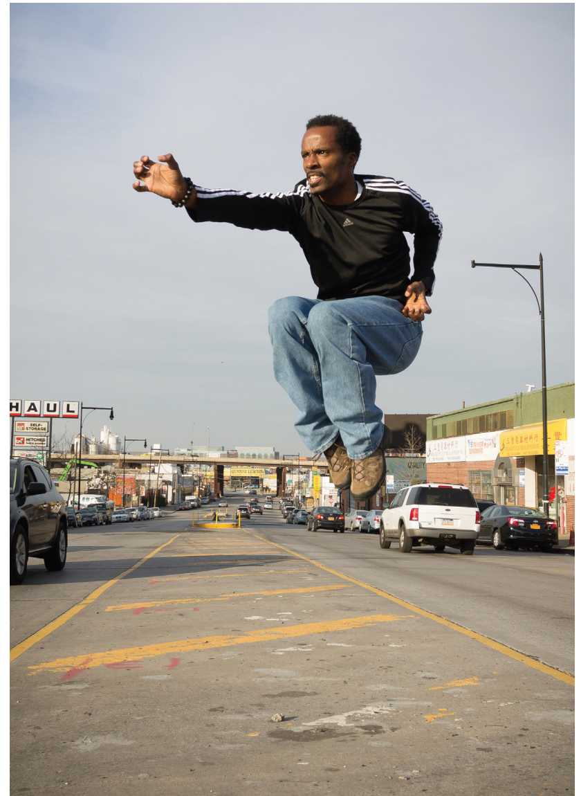
Mesan , archival inkjet print, 24" x 36", 2014