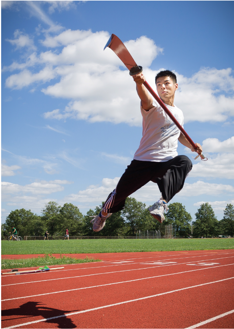
Albert , archival inkjet print, 24" x 36", 2014