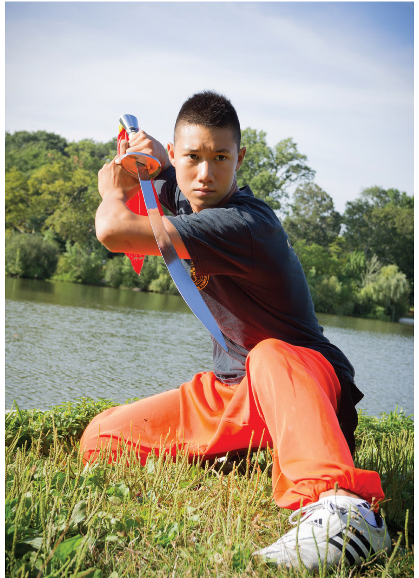
Paul , archival inkjet print, 24" x 36", 2014