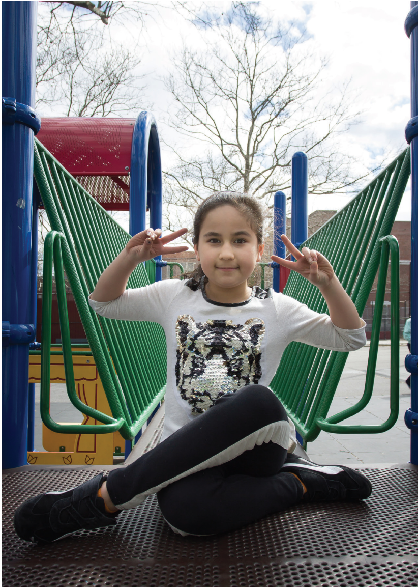
Xia , archival inkjet print, 24" x 36", 2014