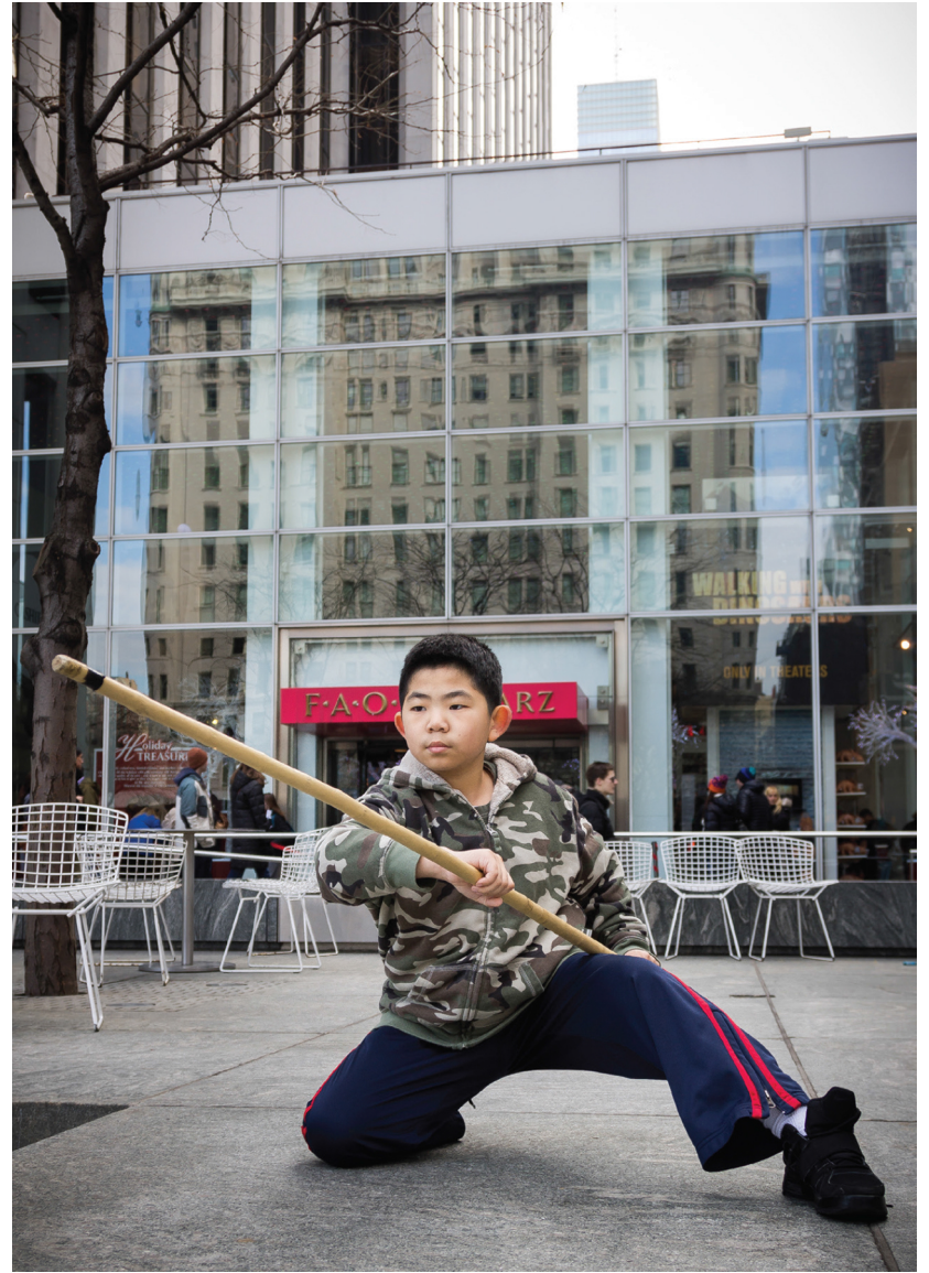
Nickolas , archival inkjet print, 24" x 36", 2014