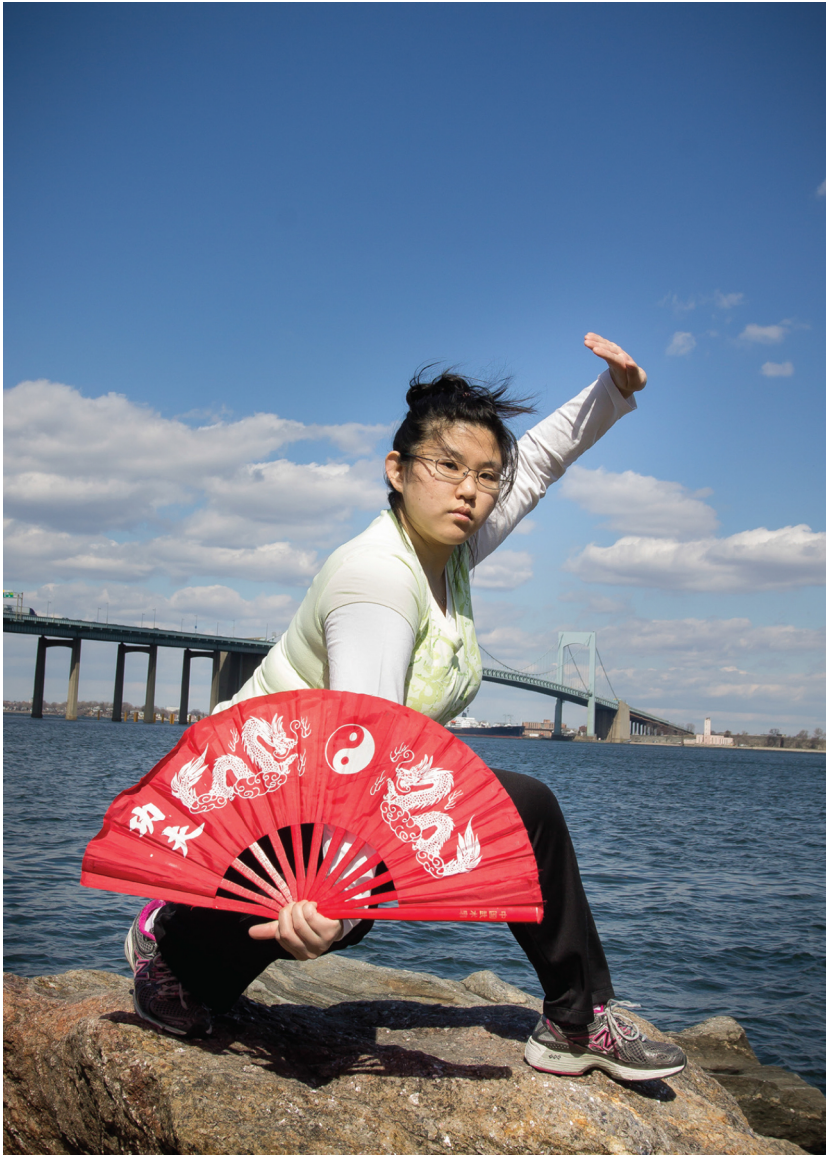
Kristina , archival inkjet print, 24" x 36", 2014