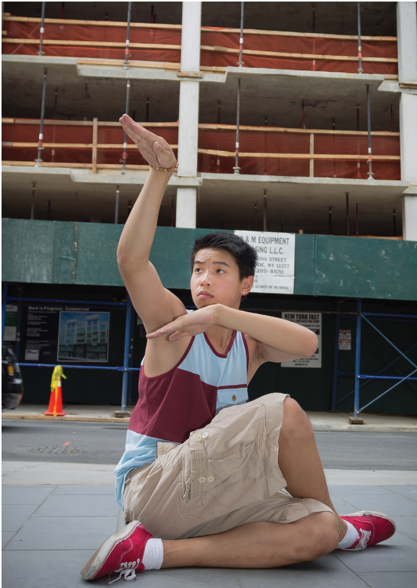
Albert , archival inkjet print, 24" x 36", 2014