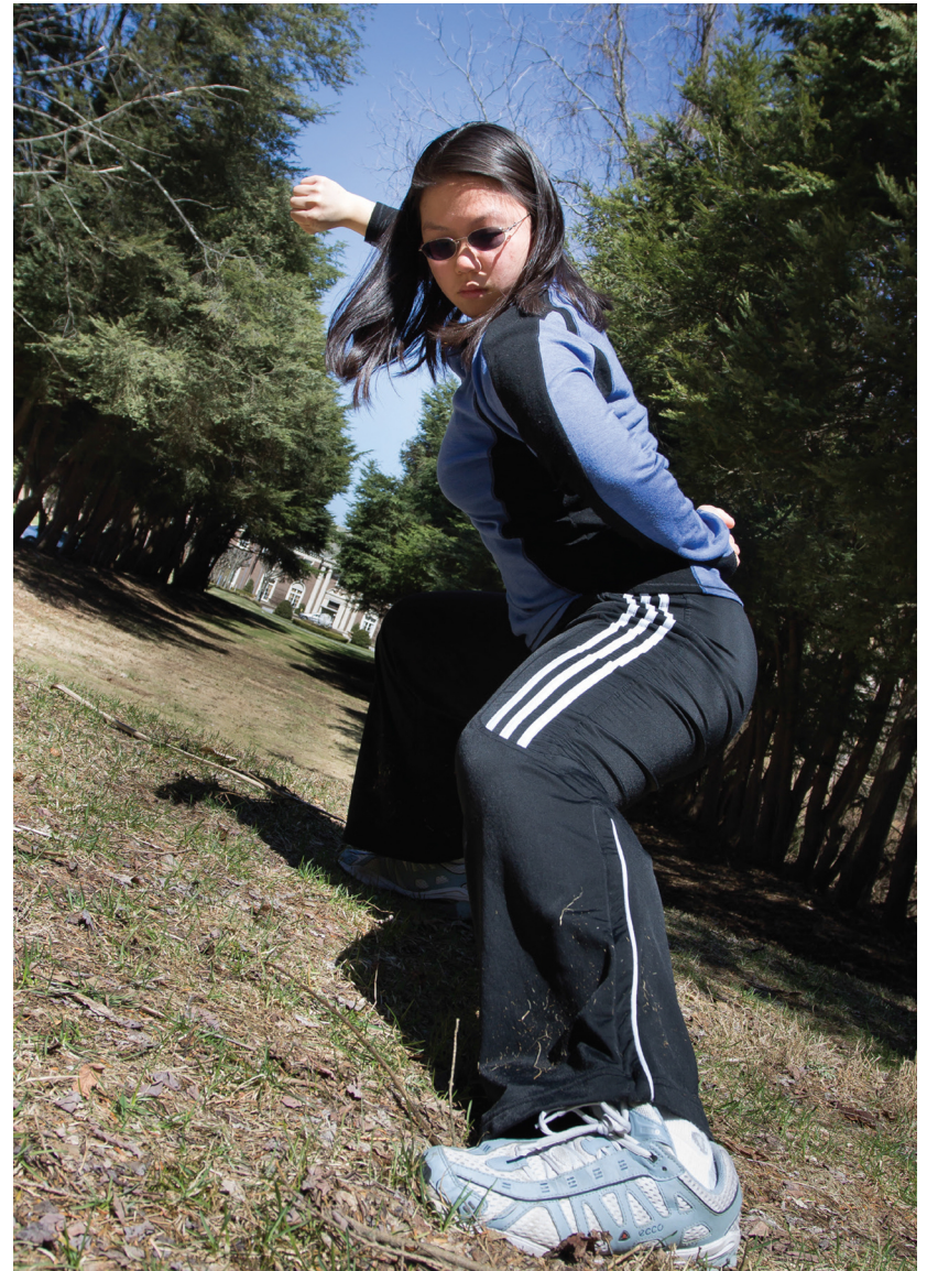
Kayla , archival inkjet print, 24" x 36", 2014