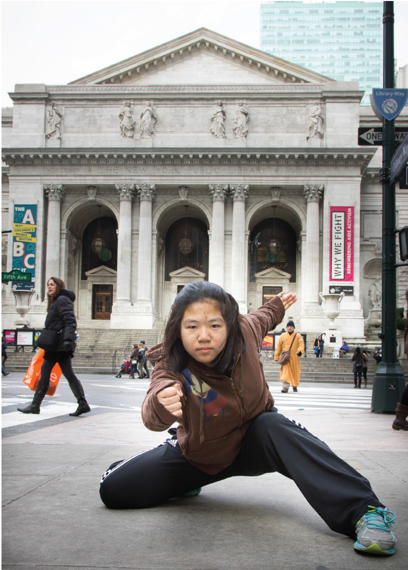
Sarina , archival inkjet print, 24" x 36", 2014