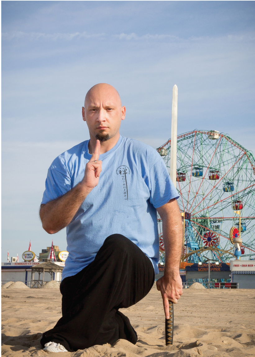
Vladimir , archival inkjet print, 24" x 36", 2014