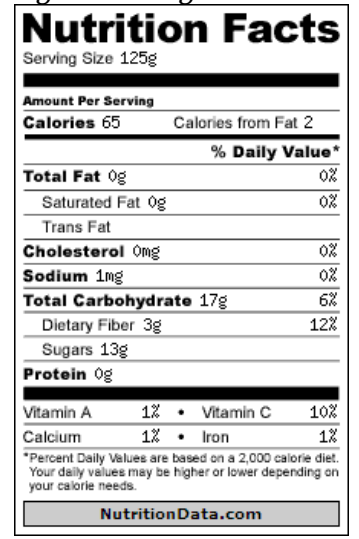
Figure 1: Original