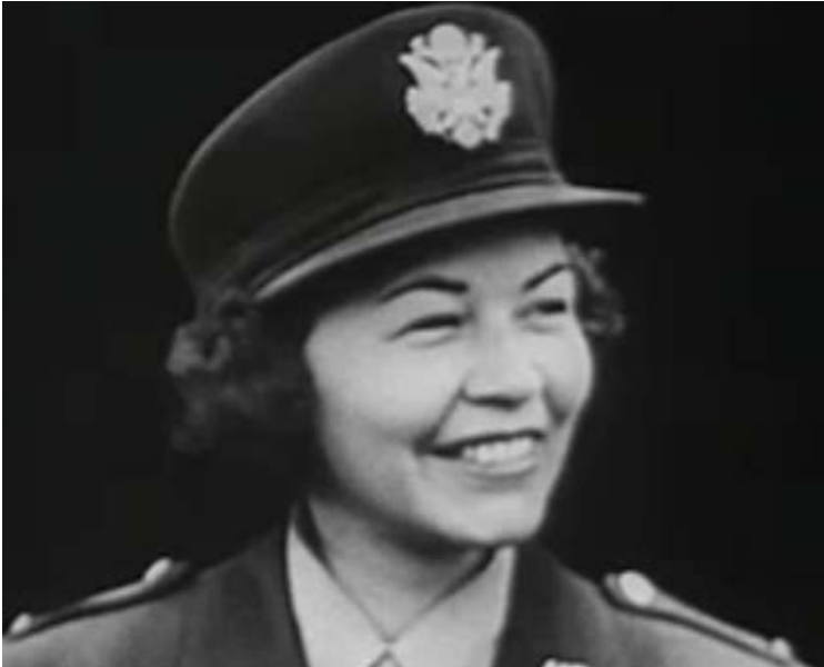
Figure 6: Still from The Army Nurse with close-ups on individual nurses to highlight their patriotic heroism.