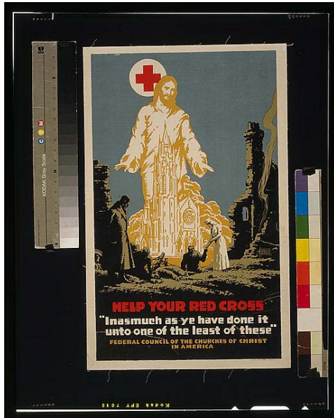
Figure 1: "Help Your Red Cross" – Hubert Chapin, 1917