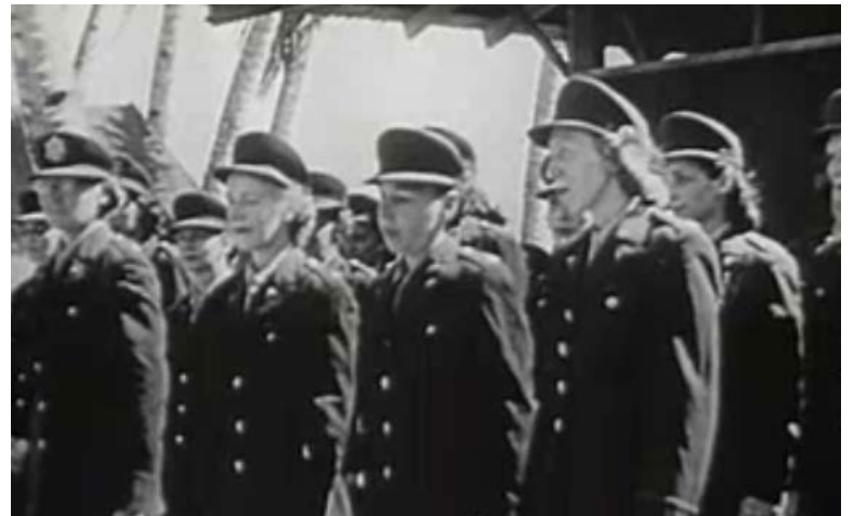
Figure 4: Still from The Army Nurse with nurses in uniform.