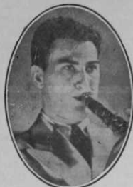
Artie Shaw and his clarinet to be featured at the Junior Prom.