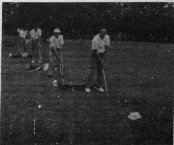
Providence golf team ready to tee-off down South.