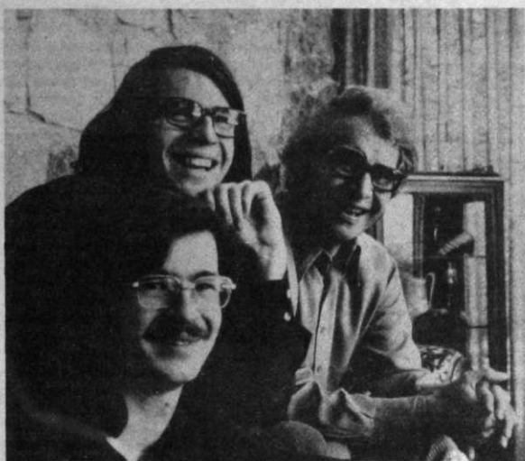
The Brubeck Trio

In any event the Film Society will continue to present films which do not preclude entertainment for the sake of art or vice versa. Sands apologized for the debt that the Film Society had amassed and added that it was not entirely their fault. In the future there will not be such a debt, because the Society is only handling the "art" films.