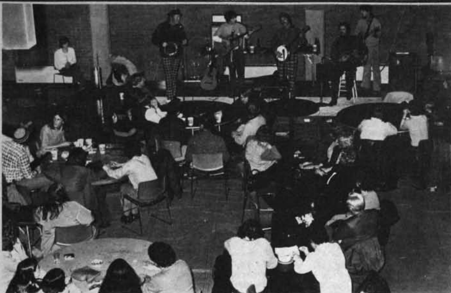
Cowl Foto by "Papadopolis" Golembeski

"Does anybody feel purged?" he said. The audience laughed softly. The customary wine and cheese flowed. If the audience was not purged, at least they enjoyed themselves enough to stay through the two-hour reading.