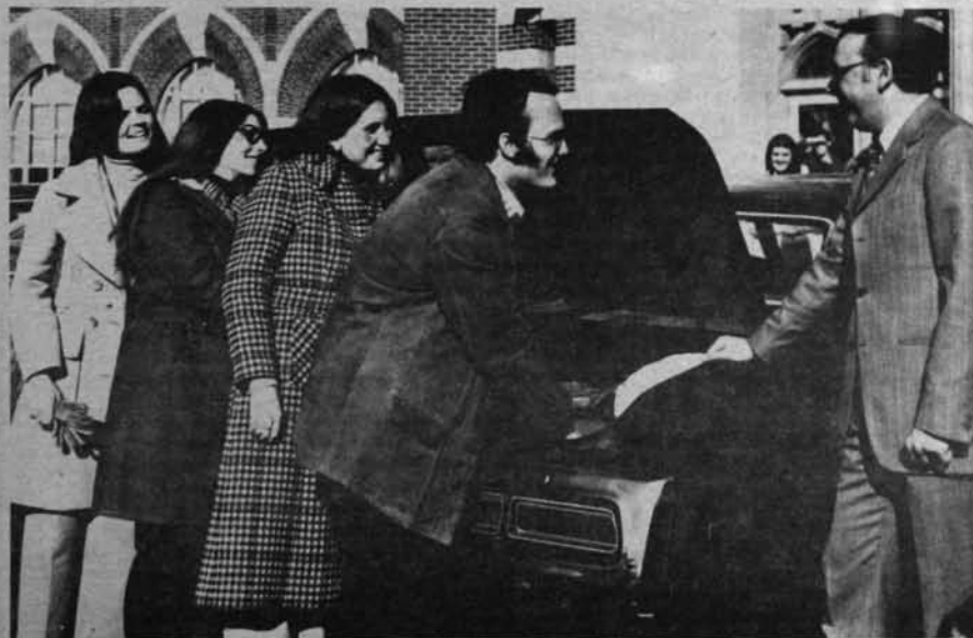
Cowl