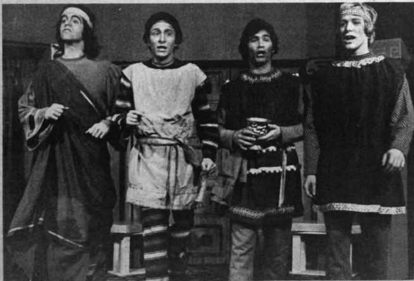
Cowl Foto by Chester Browning

ROTC student would envy. To be mentioned also for a good performance are Alex Tavares,