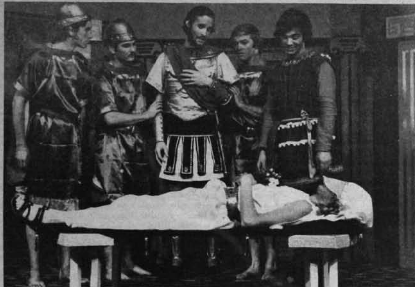
Cowl Foto by "Yamamoto" Browning

musical comedy presented last week by the Theatre Arts Department strove to fulfill the above proposal and in many ways it did do just that. A crowd-pleaser, "Forum" succeeded heavily as a comedy, although it fell short of its musical stature at times.