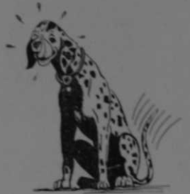
College Mascot rejoices at the success of the Junior Prom