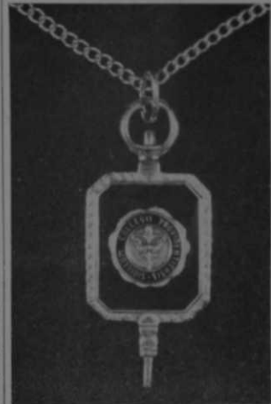
The Prom Favor pictured above is the gift of the Class of 1950 to all the young ladies present tonight. May it serve as a constant reminder of the Junior Prom of 1949.