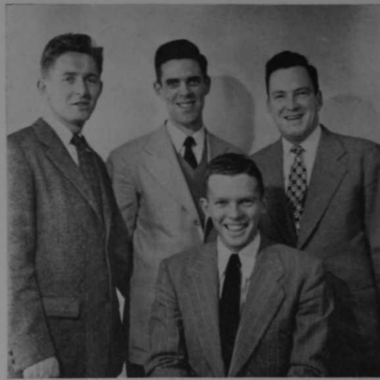
Junior Class Officers