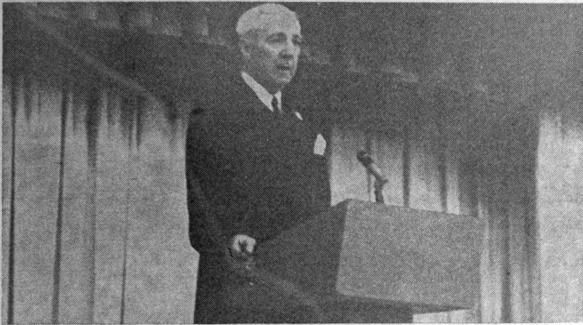
Dr. John Rock, noted Gynecologist, speaks at PC during Ecology Week.