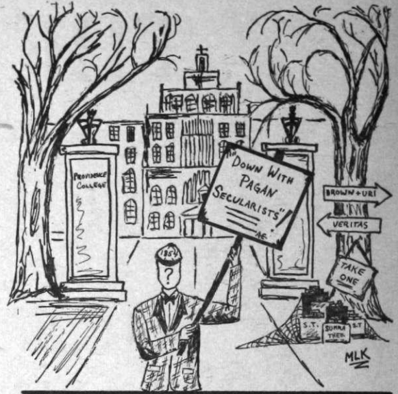
"Up from Liberalism"

All we can say in conclusion is that swift action without reservation must be taken on this report if it is to be of any meaningful benefit in promoting cooperation between the students and the rest of this academic community.