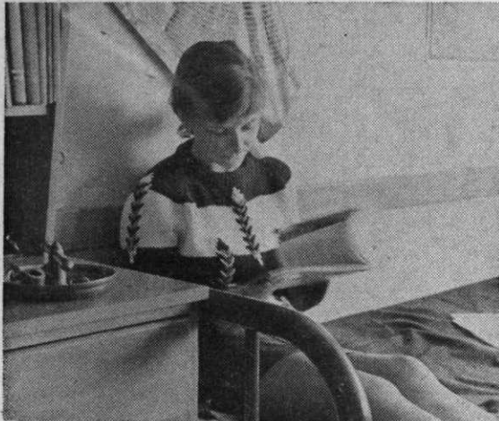
"If a door is ajar, then what is a bed?"

Curriculum Comm. Guild Room 8p. m. Monday