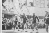
Color Guard on Fifth Avenue.