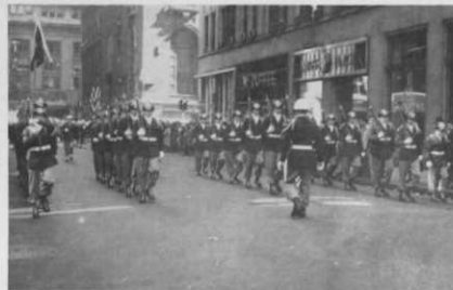
Alignment and Timing Providence College Style.