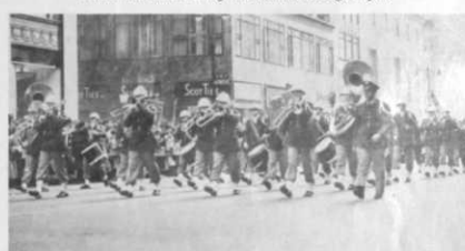
P.C. Musicians Serenade the Empire Staters.