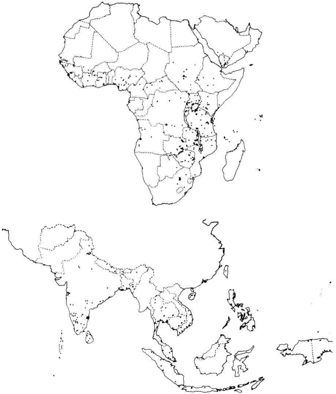
Figure 1. Maps of (a) Africa and Arabia, and (b) S.E. Asia, Indian Ocean Islands and Indian sub-continent, showing collection points of S. asiatica specimens examined. • represents collection sites.