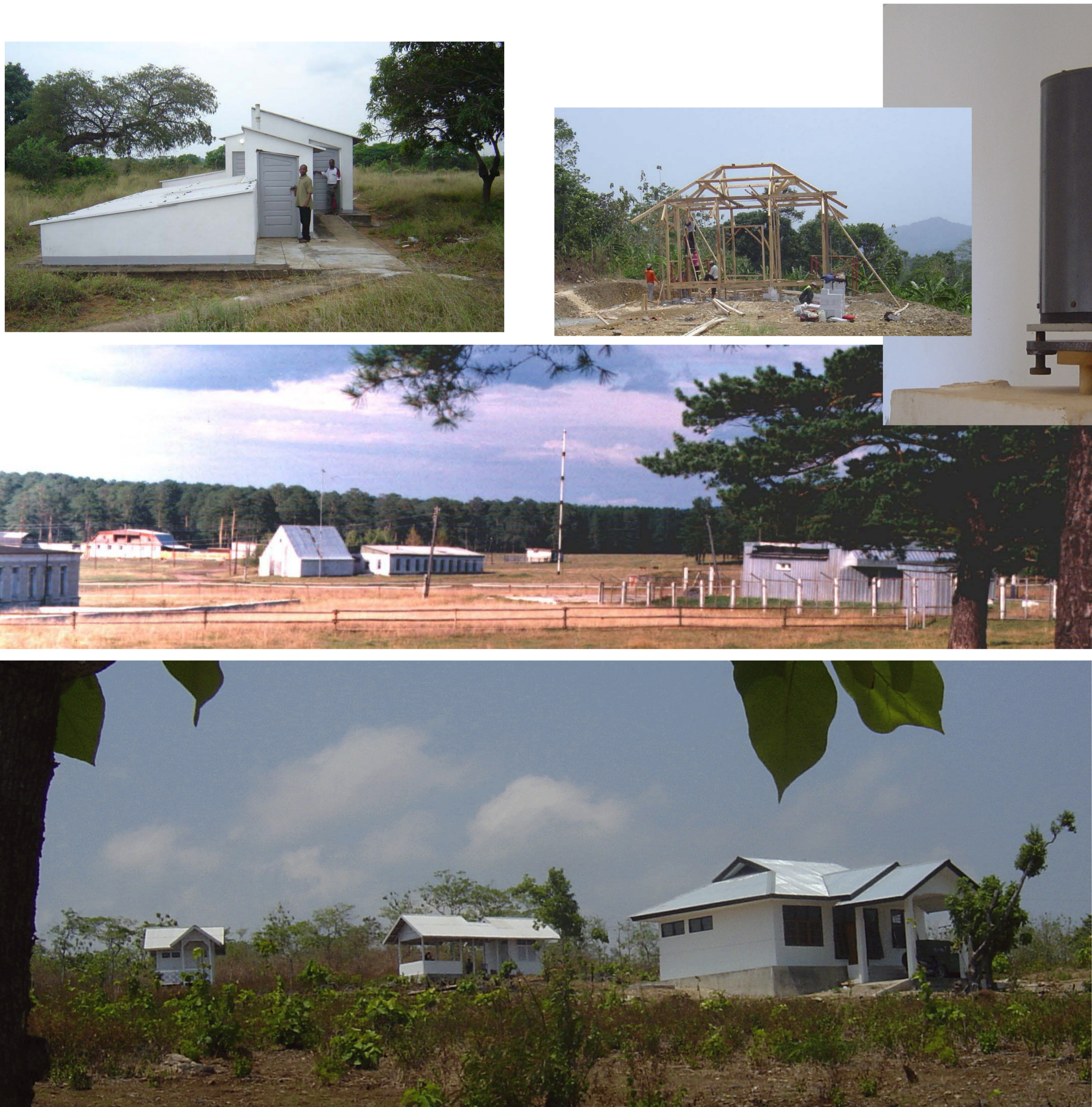
Figure 1: Pictures of INDIGO installations. Top: Variometer house at Maputo, Moçambique; the newly erected variometer house in Pelabuhan Ratu, Indonesia. Middle: Arti observatory in Russia. Bottom: the new Kupang observatory in Timor-West, Indonesia.

We find that the installation of successful observatory also depends on the motivation of the local observatory staff; with the help of the INDIGO project, most common problems can be overcome.