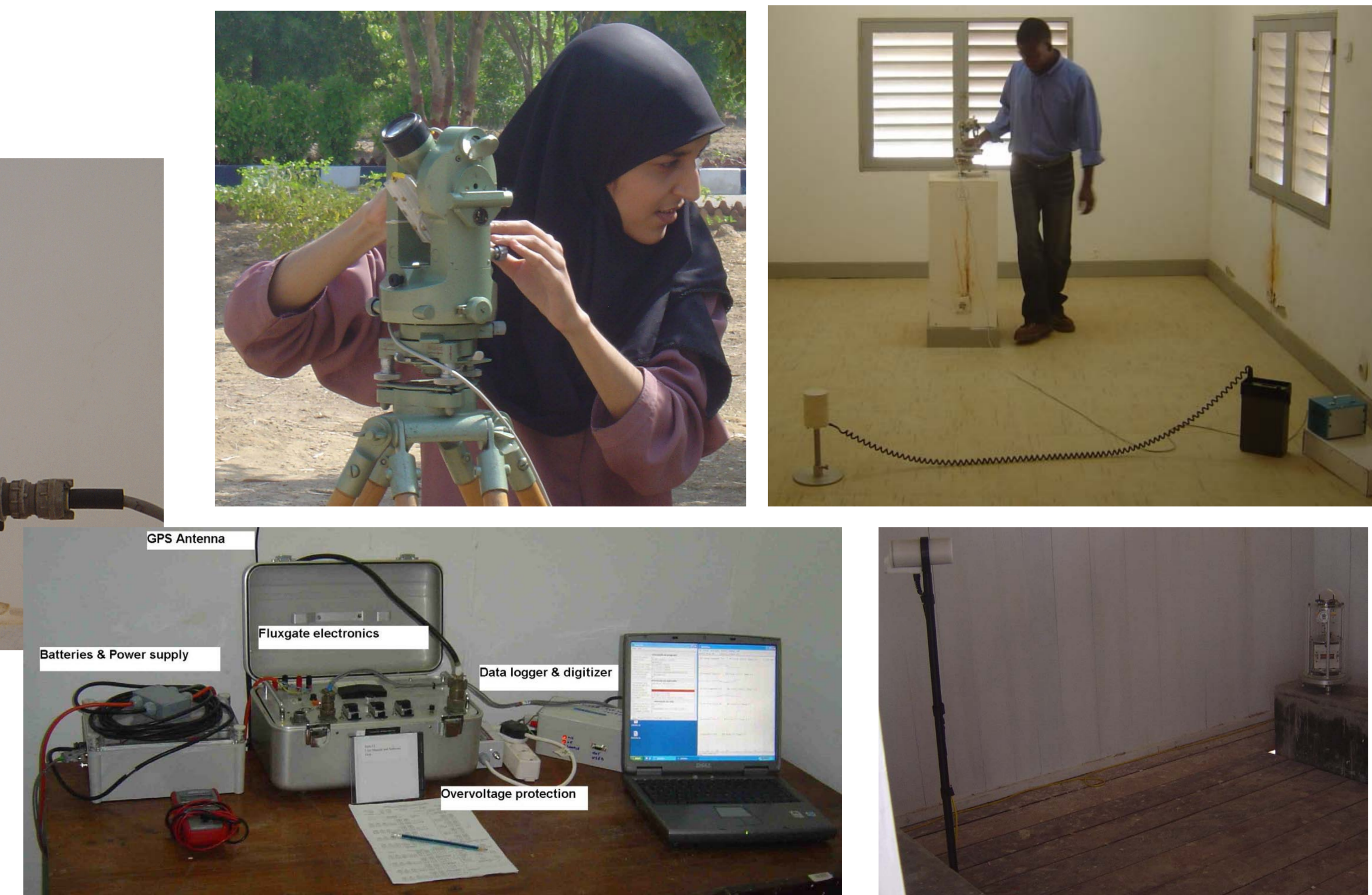
Figure 3: Typical INDIGO hardware. Clockwise from top left: The EDA triaxial fluxgate sensor in Nampula; The Tavistock Diflux operated in Karachi; Absolutes in Nampula with a Ruska Diflux and a Geometrics proton; DMI and GEM recording magnetometers in Kupang, Timor-W; EDA console and INDIGO logger in Maputo, Moçambique

More recently it was realized that it would be possible to do away with the PC altogether, by connecting a USB memory stick directly to the digitizer through a custom stick writer. This allows us to log the data in the required format without use of a PC. This results in huge savings in terms of power and cost and would allow a modest battery to power the system for days. Monitoring of the data log can be done on an optional PC running a new piece of java soft: INDIGOWatch.