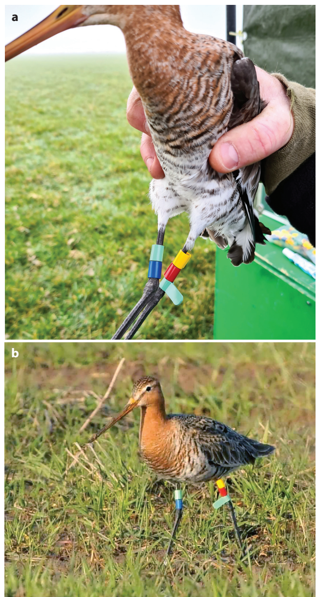
Fig. 1. (a) Godwit YRLf/LB during ringing in The Netherlands on 23 March 2021. (b) Godwit YRLf/LB seen in Russia on 2 May 2021.

In the second half of the 20 th century, the breeding range of Godwits in European Russia expanded 450–500 km to the north; they started to breed up to the north of the boreal zone (Lebedeva 1998, Sotnikov 2002, Popov & Starikov 2015, Spiridonov 2020). Data on the breeding population in European Russia remain approximate. The most recent estimation varies widely from 12,000 to 117,000 breeding pairs (Spiridonov 2020), but the estimation of 25,000–45,000 pairs for 2010–2018 by