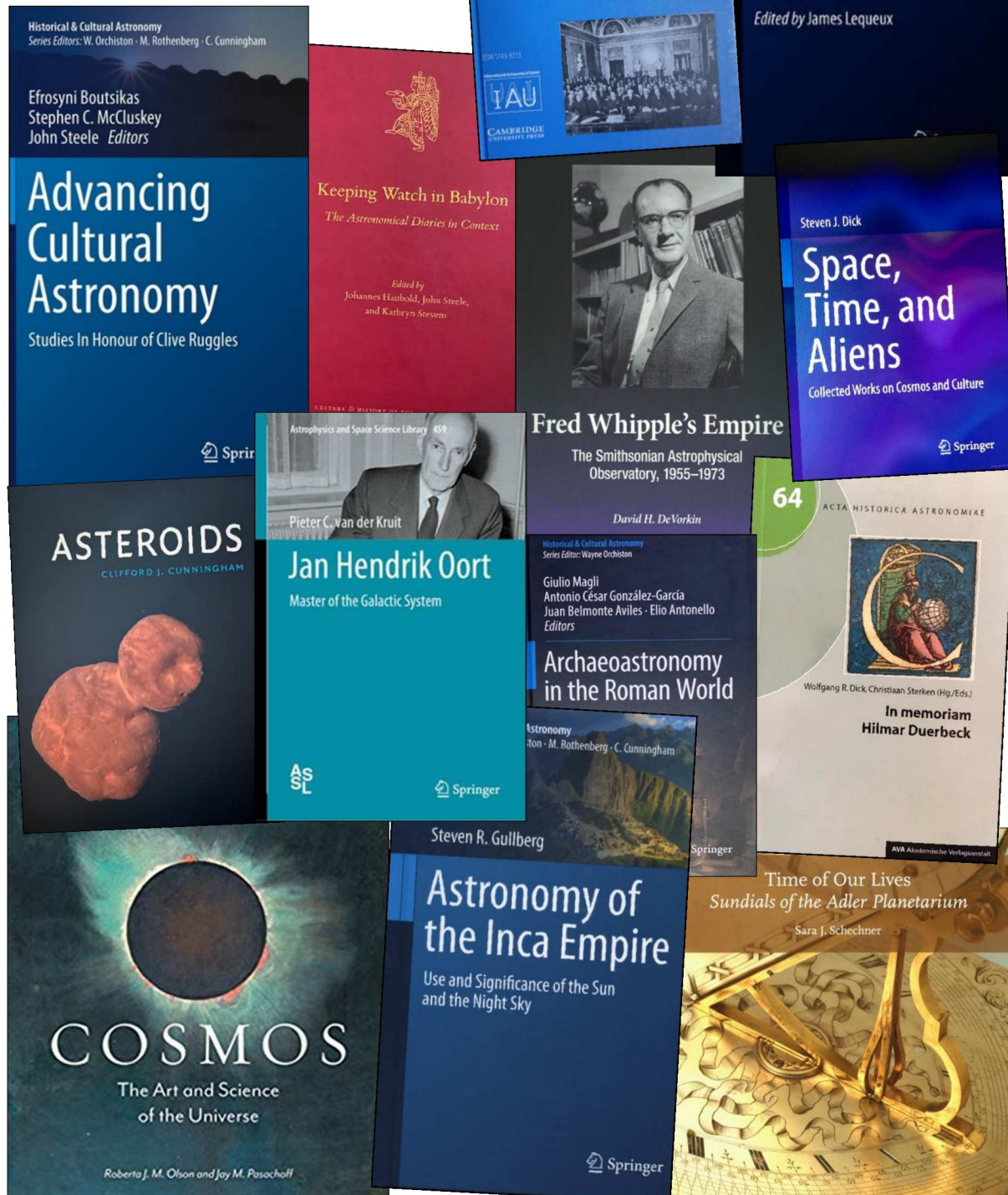
Figure 4: A selection of the covers of books penned by C3 members during 2018–2021 (from the publishers' web sites).