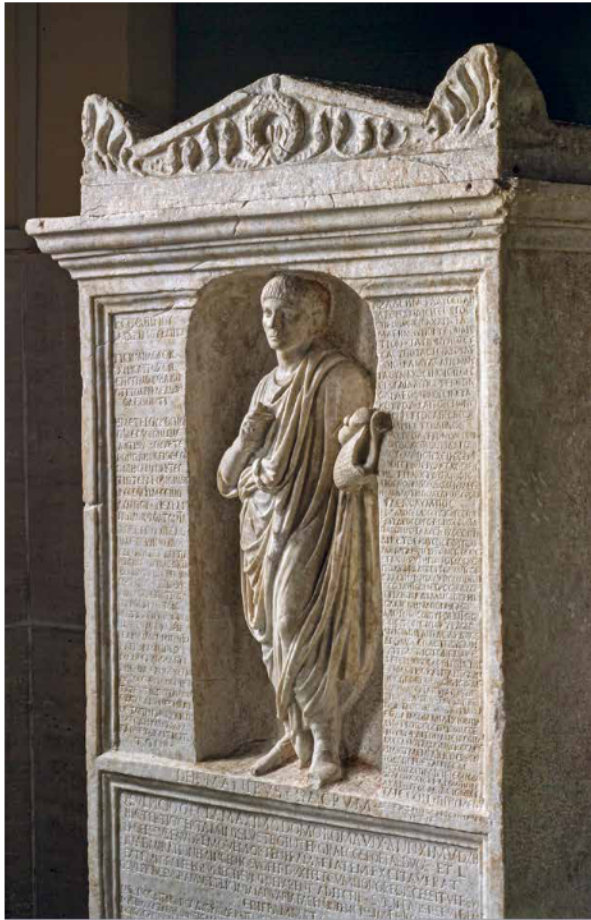
Fig. 1. Funerary monument of Quintus Sulpicius Maximus. Rome, Musei Capitolini, Centrale Montemartini, inv. MC 1102/S (courtesy Rome, Sovrintendenza Capitolina ai Beni Culturali; photo Zeno Colantoni).

was frequently compared. 8 The festival opened with a procession of the delegations from the festival sites on the Campus Martius to the newly restored temple of Jupiter on the Capitol, where joint sacrifices may have taken place for the Capitoline triad and the Emperor. The Emperor's appearance was a carefully stage-managed mix of Greek and Roman elements. He presided over the games seconded by the priest of Jupiter, the Flamen Dialis, and by the collegium of the Sodales Flaviales Titiales, the priests responsible for the cult of the Flavians, who bore Domitian's own image in