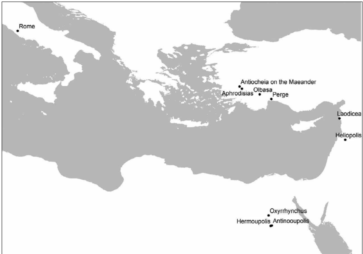
Fig. 4. The location of Capitolia and Isocapitolia (map authors).

critics arose especially after Domitian's death. 36 In one of his letters, Pliny approvingly quotes the comments of an old curmudgeon, Junius Mauricus, who upon hearing that Greek-style contests had been abolished in Vienne (Gaul) wished that they could also be abolished in Rome itself. 37 Such criticism does not seem to have had an effect on the Capitolia, however, nor on the popularity of Greek athletics in Rome. The Capitolia not only continued, but were actively supported by later emperors, as were other athletic contests. Hadrian rearranged the 4-year Greek festival calendar, and confirmed a fixed position of the Capitolia between the Hadrianeia of Athens and the Sebasta of Neapolis. 38 His main concern appears to