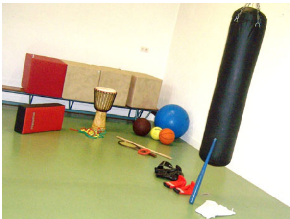
Figure 1. Boxing bag.

Educating patients about the basic principles of aggression regulation is part of the intervention. Generally, in the beginning neither patients nor most therapists