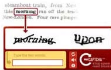
Figure 4 reCAPTCHA Box

narrative seldom resonates with general users. Online activities like typing out distorted and funky looking letters in the “reCAPTCHA” boxes (Figure 4 ) whenever we need to prove we are not robots are, as Trebor Scholz observes, more “akin to those less visible, unsung forms” of women’s reproductive labor. 247 Each reCAPTCHA (now owned by Google) takes about 10 seconds to solve, but one month accumulation of these invisible labor for deciphering and transcribing data has helped digitize two years’ worth of New York Times archives. 248