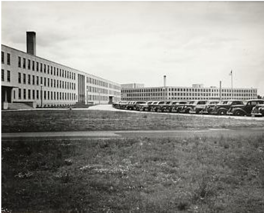
Figure 2 Census Bureau Headquarter in Suitland, MD (1942-2006), known as federal office building #3