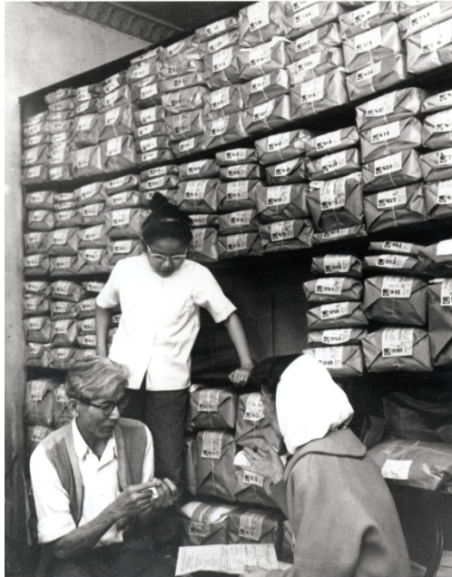
Figure 3 An Enumerator collected census information from owners of a laundry for 1960 census

Data generation infrastructure mandates not only government's leading role in the economics of scale, but also institutional reorientation and correspondent organizational changes. IBM's withdrawal from the New Haven's model city project can be partially attributed to uncertainty about the degree of organizational restructure to which the municipal office would achieve. Tasks like coordinating different departments to adopt a single data input format required changes to data collection routines in the first place, adequate trainings for relevant personnel, and timely technical support. The process was long, gradual, and much more sophisticated than putting latest computing equipment in place. Indeed, many other local initiatives for central data banks similar to that of New Haven's project failed to come true in the 1960s largely because of underestimations of organizational restructuring costs and efforts in addition to technological adoptions.