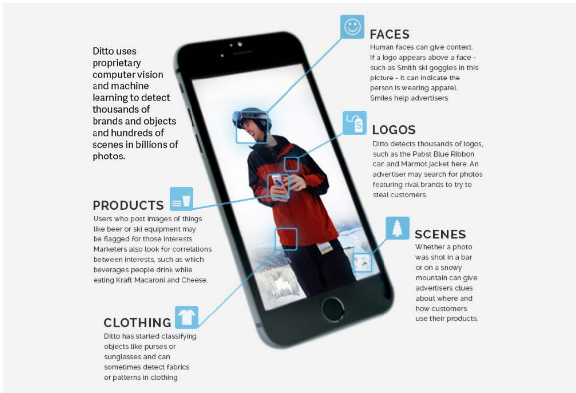
Figure 6 Capturing Data from Selfie

None of the datafication power to substitute data with metadata or manufacture new data categories or draw definitive boundaries for new data categories would happen without the application of algorithms. Algorithms are what Bill Maurer calls “sense-making tools that sit on top of data.” 345 Data are of no value at all, no matter how large and inclusive the data collection is, if they are left untouched on the computer. “Ultimately, the value of data is what one can gain from all the possible ways it can be employed.” 346 Algorithms are essential for any possible ways of employing data.