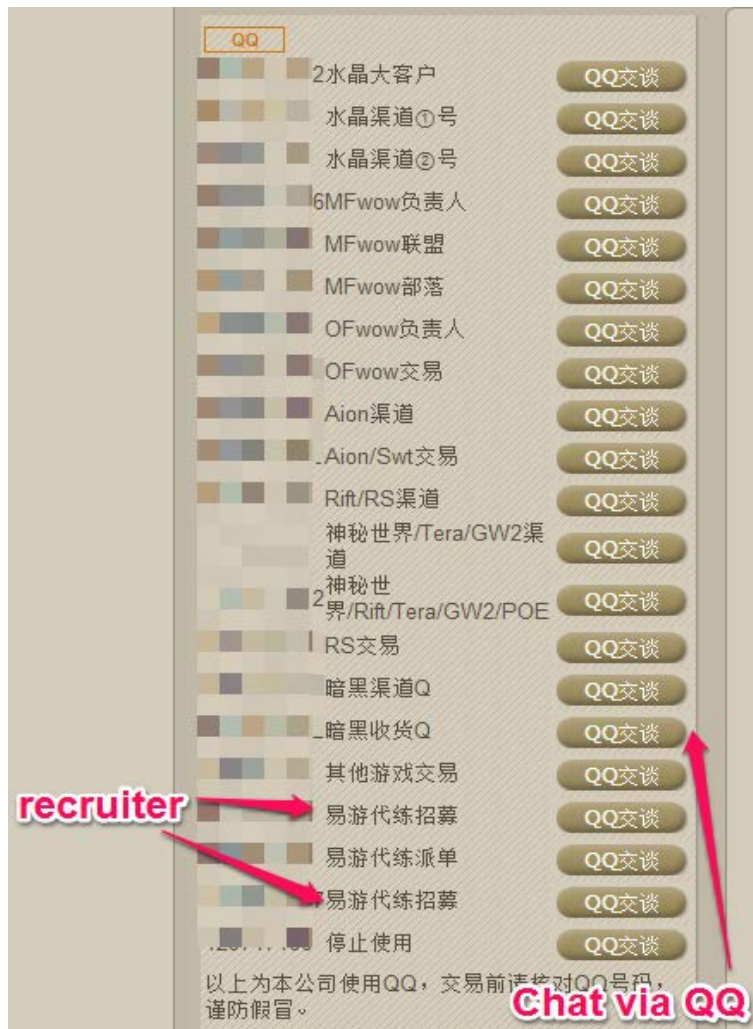
Figure 9 Screenshot by the author from www.guy4game.com.cn (in January 2013, red annotation by the author)

Two display languages of the same Guy4Game website shows a built-in differentiation mechanism which presumes that Chinese visitors to the site are more likely to be potential game play-workers as opposed to English visitors, who are seen as potential consumers. Interfacing between Chinese and American and European players, transnational virtual goods brokers like Guy4Game in fact have reinforced the labor division in the virtual world along national borders. And linguistic boundaries preinstalling identity differences between producers and consumers further makes gold farmers' labor invisible.