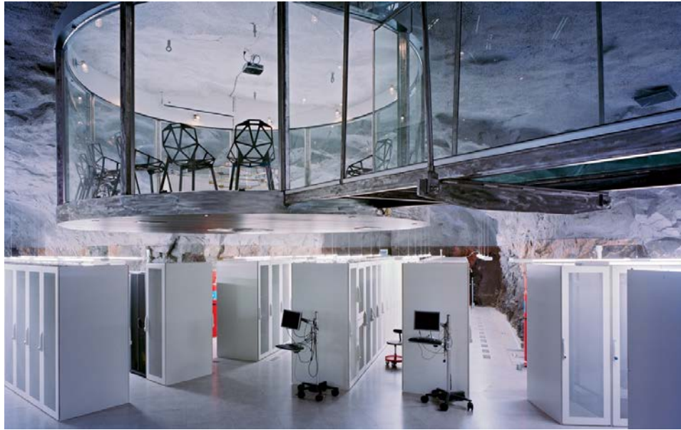
Figure 10 WikiLeaks data facility

Two stunning pictures from the book are emblematic of the authors' reasoning for who must be cut out of the Big Data picture. Two photos are juxtaposed facing each other. 431 On the left hand, there is an overall view of the Federal Bureau of Investigations (FBI) under John Hoover's directorship (in 1941) (Figure 10). Rows after rows of filing cabinets stood in the picture with many female workers reading, sorting out, and looking into files in front of filing cabinets. On the right hand is a picture of WikiLeaks data facilities, located hundreds of feet under the ground near Stockholm, Sweden (Figure 11). The authors intend to illustrate that what used to be the center of the civil surveillance is now overthrown by technologies that defy geographical borders and allow for transmissions of secrets and intelligence as long as the Internet connection is provided. The Internet and the decentralized organization of (Big) data facilities are the symbols of empowering citizens against Big Brother.