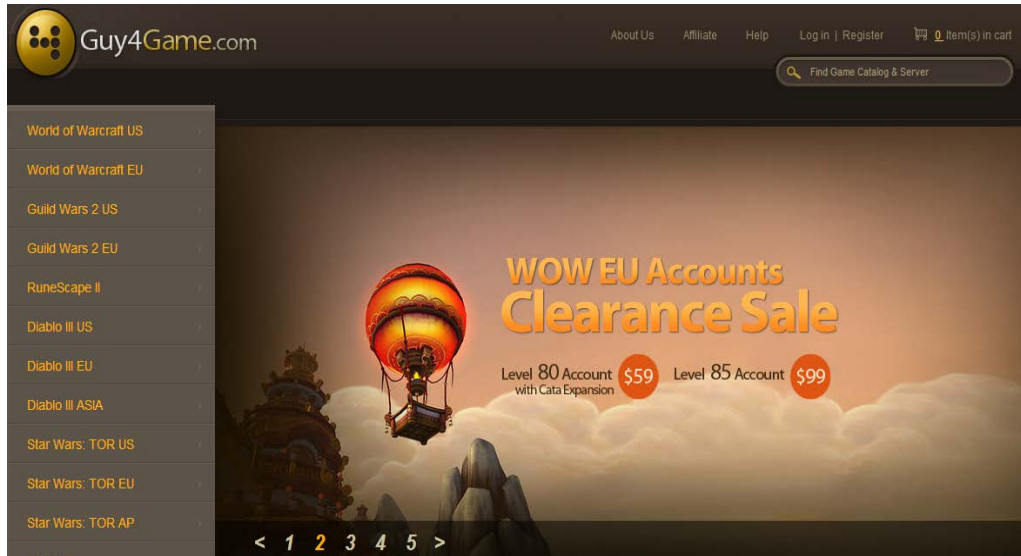
Figure 7 Screenshot by the author from www.guy4game.com (in January 2013)