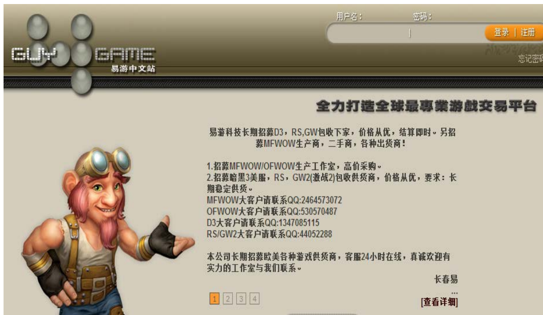
Figure 8 Screenshot by the author www.guy4game.com.cn (in January 2013)

A comparison of the English version of Guy4game