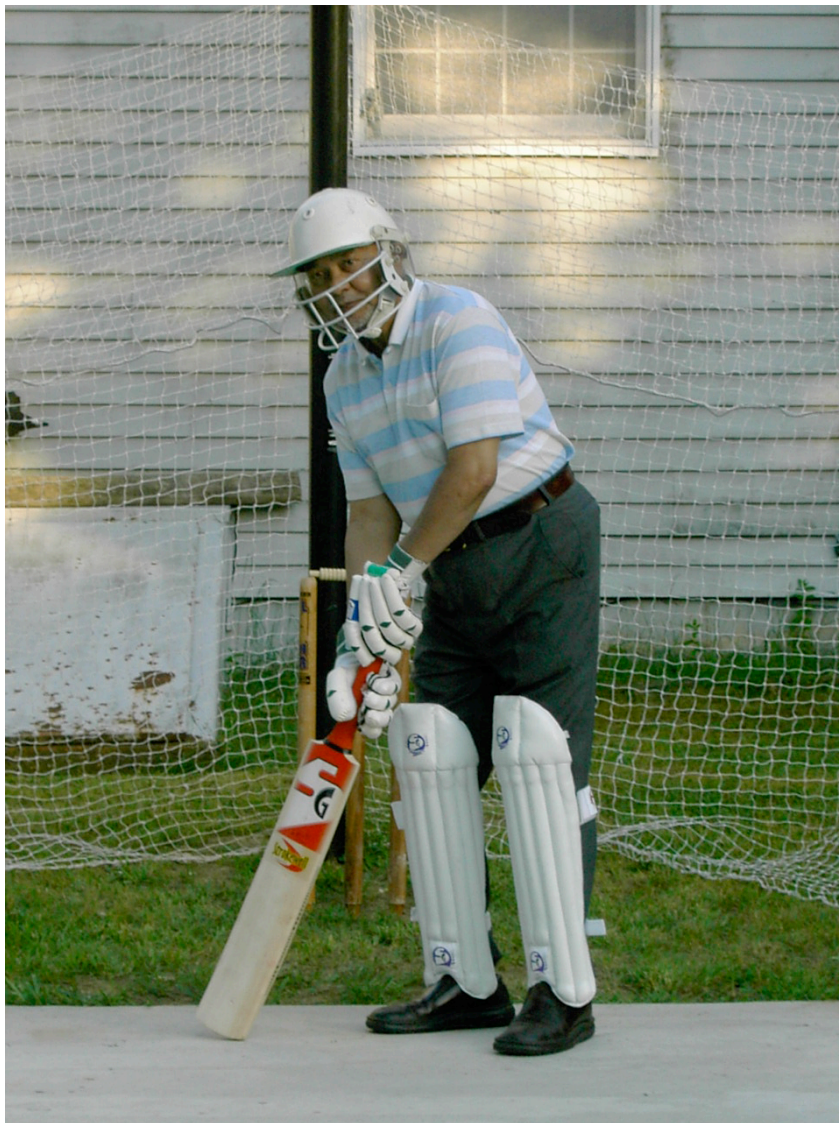
My Dada playing Cricket in our back yard 2003

After this incident Dada says that God has given me a new life after this serious sickness. Thank God.