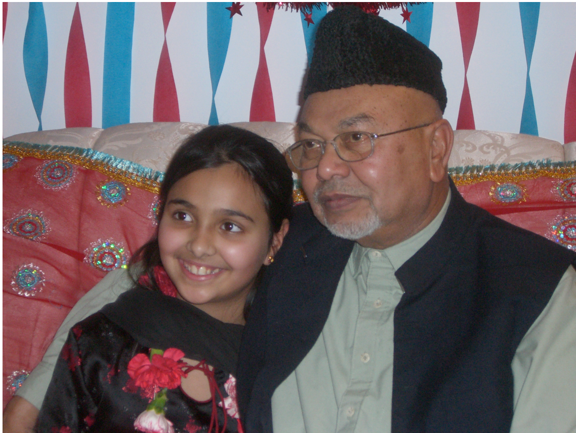
Dada with me in 2007- when I had completed the Holy Quran

“from the day I was born to now, God has not left my side, when you die all you will bring with you are your deeds. All of these things don’t matter {he points to everything in the house} unless you do something good in this world. Everything will end in this world, but God is Everlasting, he will never leave your side.”