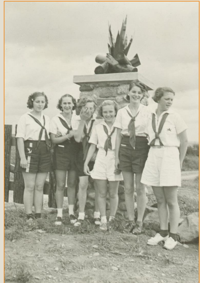
Campfire Girls, undated, MS 32