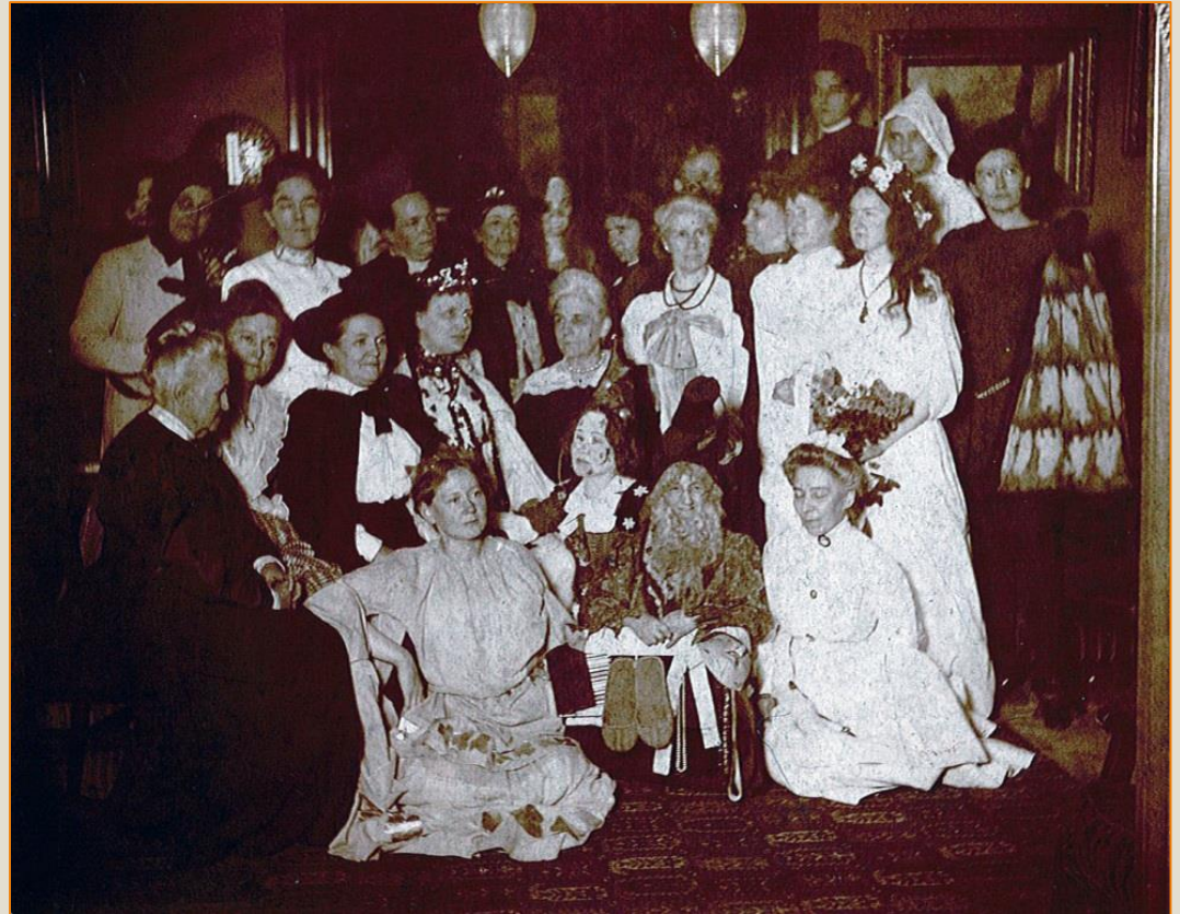
Silver Creek Shakespeare Club, MS 53