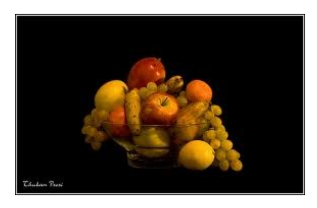
1 Scene 4