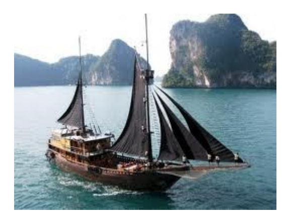
The boat last scene