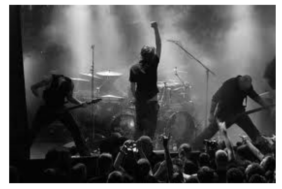
6 Scene 3