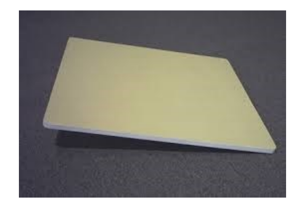
5 Scene 2