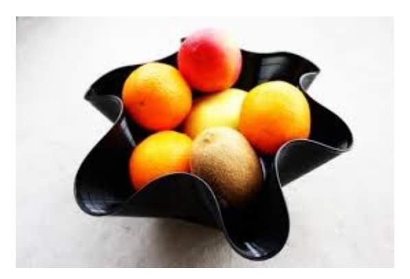
1 Scene 2