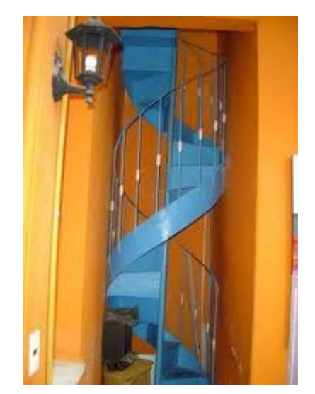
Device of the storm machine