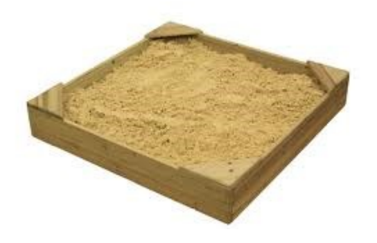
For Caliban's sand well