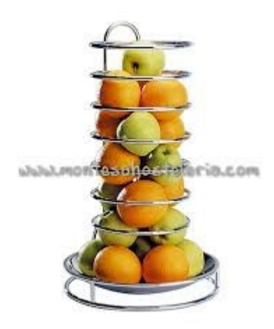
1 Scene 5