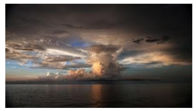
8 Scene 2