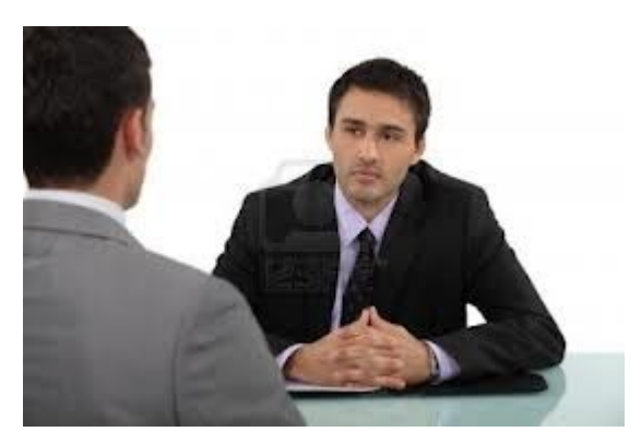
6 Scene 2