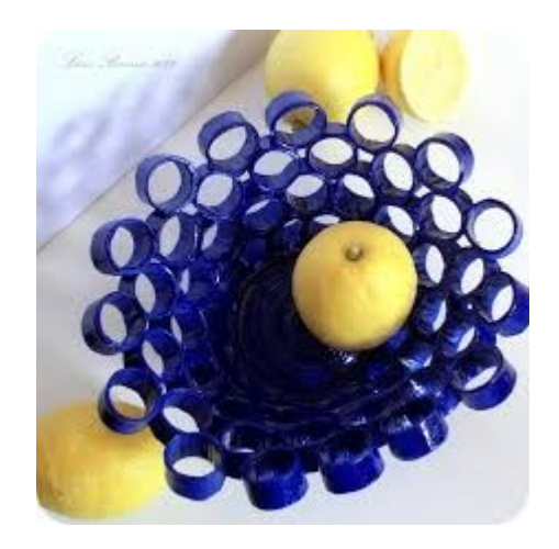
1 Scene 3