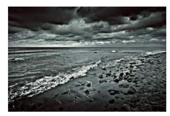
8 Scene 3