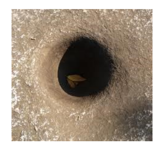
3 Scene 2