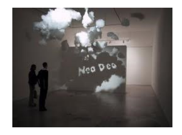
2 Scene 2