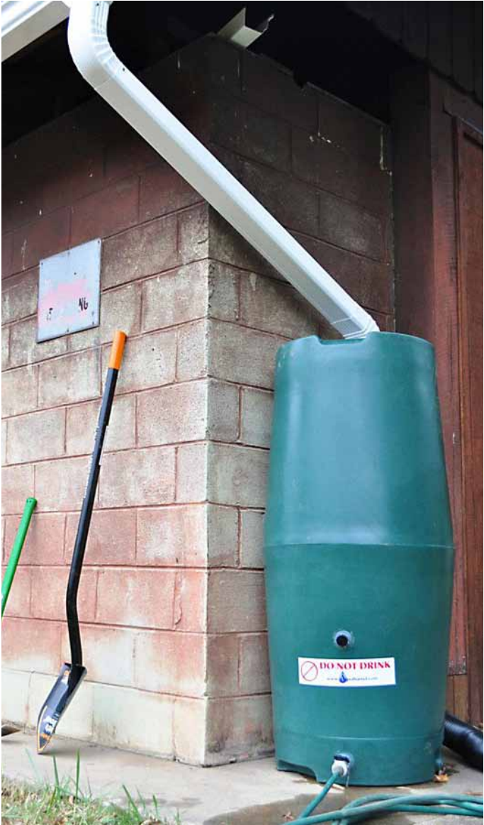
Rain barrels conserve water by collecting rain water from roofs. Rain barrels can then be used for watering gardens and washing cars.

Environmental attitudes are also highly related to the awareness and adoption rates. Environmental attitudes were measured based on household responses to provide ratings to two