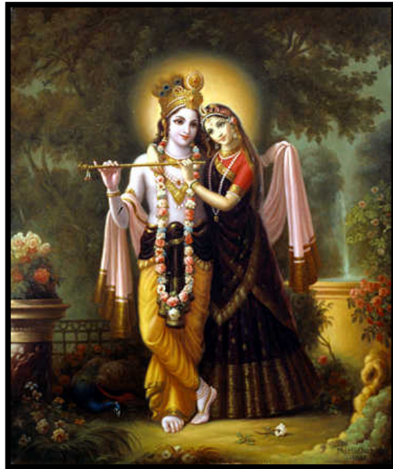
Fig. 2. Lord Krishna's love with one gopi , Radha, represents the divine love between God and humanity. http://templeofspirit.files.wordpress.com/2012/04/radha_krishna.jpg .