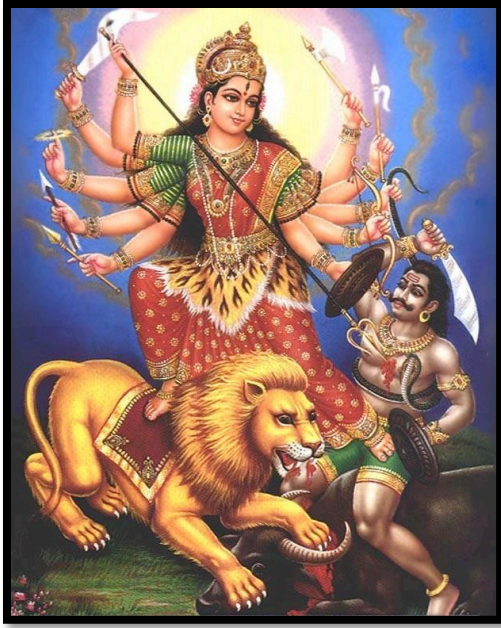
Fig. 9. Goddess Durga, known as “divine mother,” is said to be the power behind the trinity of creation, preservation and destruction of the world.

http://www.rudraksha-ratna.com/gayatri.html .