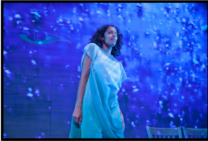
Fig. 14. Production still from Meena's Dream , produced at the Kogod Theatre, Clarice Smith Performing Arts Center, February 2013. Meena fights the thousand-headed snake in the 'ocean of sadness.' Photo by C. Stanley Photography. Used with permission.