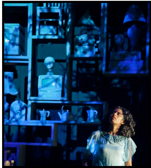
Fig. 15. Production still from Meena's Dream , produced at the Kogod Theatre, Clarice Smith Performing Arts Center, February 2013. Meena arrives in the 'forest of deception.' Photo by C. Stanley Photography. Used with permission.