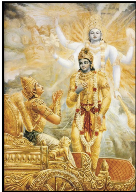
Fig. 4. Lord Krishna reveals his divinity to Arjun in crisis. http://culture.jiva.com/philosophy/herhour12.asp .

http://saveshreekrishnatemples.wordpress.com/2011/05/02/krishna-ales-lord-krishna-and-the-lapwings-nest/ .