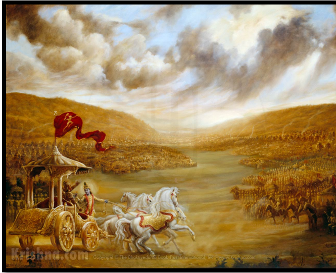
Fig. 3. Lord Krishna and warrior Arjun on the battlefield in the classic treatise The Bhagavad-Gita .

http://saveshreekrishnatemples.wordpress.com/2011/05/02/krishna-ales-lord-krishna-and-the-lapwings-nest/ .