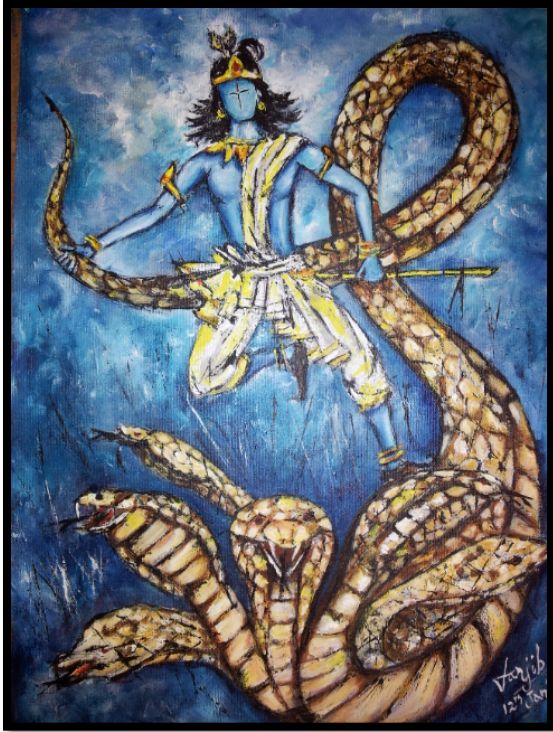
Fig. 7. Lord Krishna in his adolescence, defeats the sea snake Kaliya and dances on top of Kaliya's many heads, a story which later influenced the development of classical dance forms to demonstrate one's faith in the divine. Painting by Sanjib K. Pani. © 2012. Reprinted with permission.