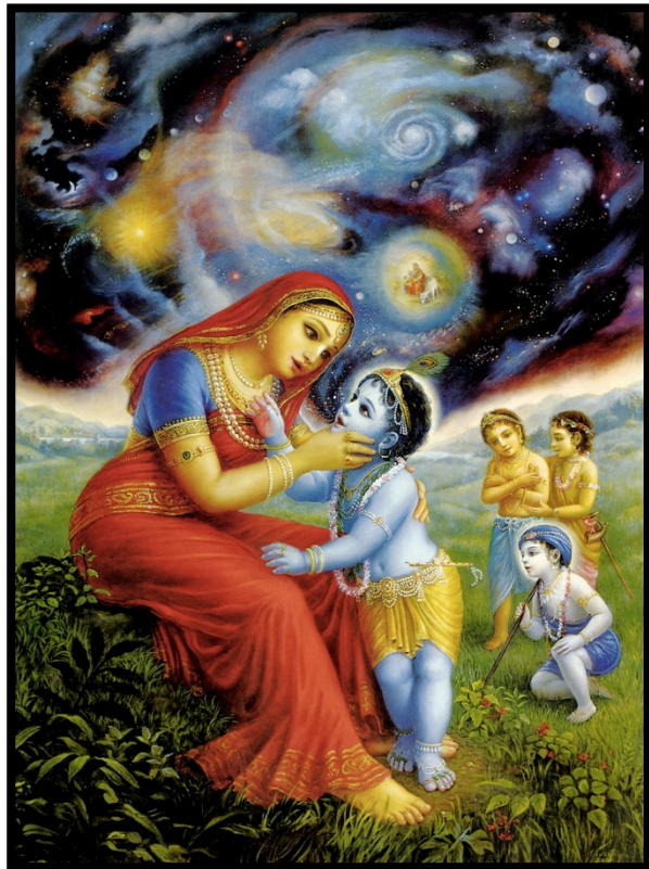
Fig. 8. Yashoda peers into the mouth of her son, Lord Krishna, and to her surprise, finds a vision of the entire universe. http://www.harekrnsna.de/artikel/krishnas-mouth.htm .