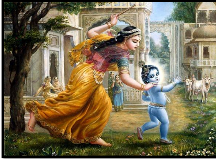
Fig. 1. Stories about Krishna, as a child, stealing butter from his mother and local gopis , or milkmaids. http://www.auroville.org/environment/villages/images/krishna_3.jpg .