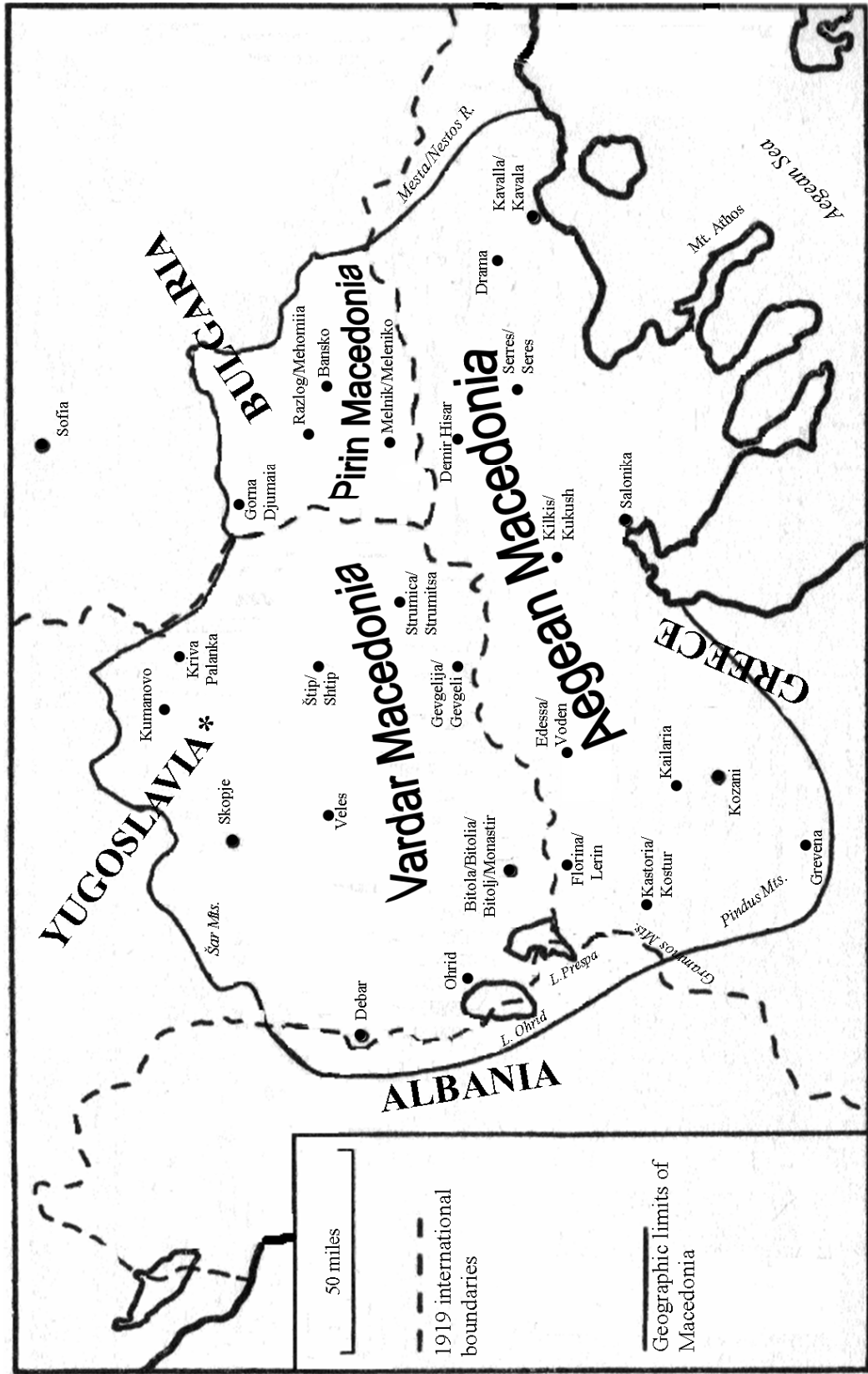
Map 2: Geographic Macedonia after the First World War (c.1919)

Adapted from Fig. 58 in H.R. Wilkinson, Maps and Politics: A Review of the Ethnographic Cartography of Macedonia (Liverpool: University Press of Liverpool, 1951), 232.