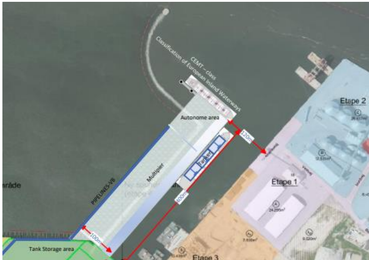
Figure 4 – Port of Vordingborg multiuse pier for autonomous bulk carriers

With respect to the autonomy calls to port, and the issue of congestion and communication, Port of Vordingborg understands that a communication procedure / platform should be developed to, for example, give warnings in times of congestion. This will have influence and/or conflict with the terms in the charterparty. Since the ships master legally has to confirm “notice of arrival”, how is this aspect dealt with, when the ship arrives autonomous. A legal matter that has to be solved in the terms of the charter party and Bill of Lading.