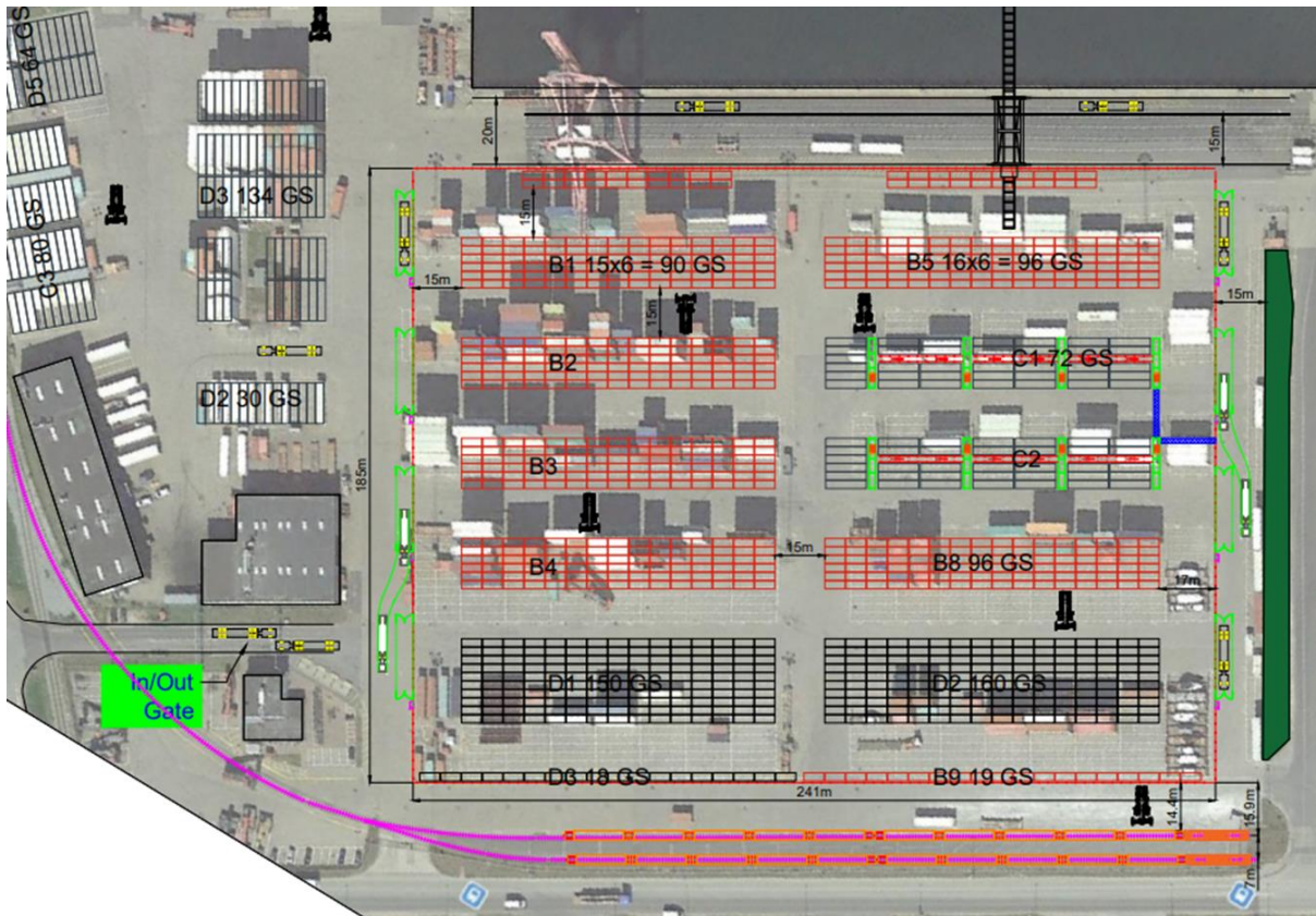
Figure 2 - The current design and layout for the automated container terminal, including interface towards the rail network (bottom/east)

Port of Aalborg wants to further develop its position as a central logistical multimodal hub for the Region of Northern Jutland. This includes to expand the connections and routes going to and from the port (focusing on rail and feeder connections) and the port is currently working on determining the feasibility of more RORO routes. In AEGIS Port of Aalborg is focusing on the design and equipment of a multimodal terminal area (Figure 1), that can contribute to this ambition and a fenced automated container terminal (Figure 2). So far, the key feature is the concept for the new automated container terminal with direct interface to the rail-network at the port. The automated terminal consists of 44.500 sqm fenced area fit with a capacity of 75.000 TEU. The conceptual study is currently being developed with the AEGIS partners.