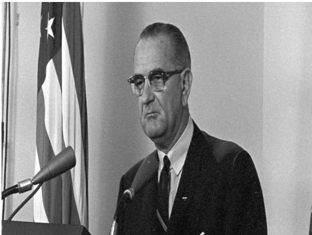
President Johnson delivers his Midnight Address on the Gulf of Tonkin Incident in Vietnam August 4, 1964

Background: On August 5, 1964 President Lyndon Johnson announced to the American people that twice in two days the North Vietnamese had attacked United States warships in the Gulf of Tonkin. Johnson stated that by engaging in these attacks the North Vietnamese displayed aggression towards the United States. US Secretary of Defense Robert McNamara reported that the evidence of both attacks was unquestionable and had been unprovoked. Although many US officials warned against a direct