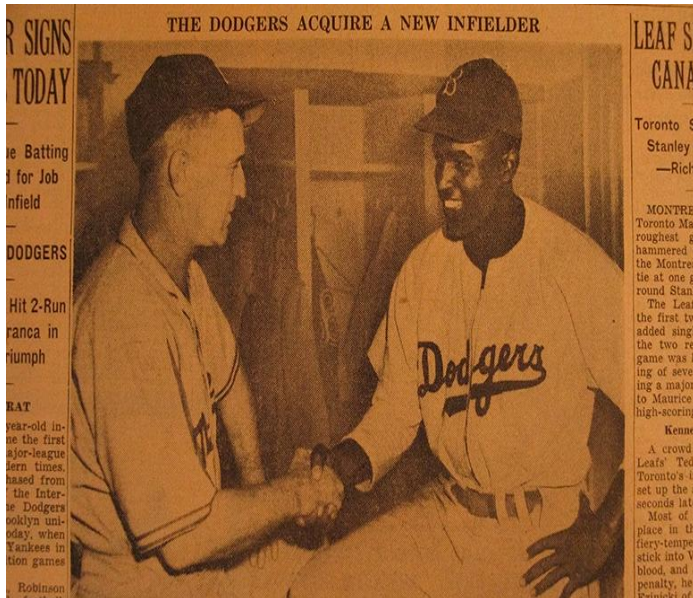
Jackie Robinson the first African American to play professional baseball shakes hands with his new manager.

Background: After the war ended, Americans were eager to get back to normal living. With renewed hope for the future, millions of young men and women married and started families. These families had so many children that the increase in birthrate from the mid-1940s through the 1950s is called the baby boom . The baby boom affected the United States in many ways. Almost immediately it helped bring an economic boom, as new houses and other buildings were built for the new families. Young parents needed such goods as food, clothing, and even toys for their children. As