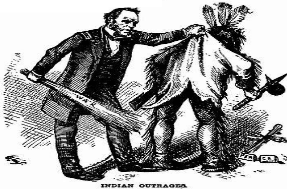
A cartoon released in 1830 depicting Andrew Jackson removing Indians from their homelands.

Background: The policy toward the Indians started by George Washington was maintained through President John Quincy Adams’s administration up to 1828. This policy can be summarized as encouraging assimilation [integrating into white society]. The feeling was that as white methods of agriculture were transmitted to Indians they would give up their traditional practices and their claims to status as separate political groups. However, this policy changed when Andrew Jackson was elected President.