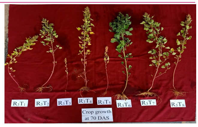
Fig. 2. Showing Quinoa growth at 70 DAS due to different types of soils ( T_1 -Clay loam soils of wetlands of TNAU; T_2 -Sandy loam soils of eastern block of TNAU; T_3 -Sandy loam soils of Mettupalayam; T_4 -Sandy clay loam soils of 36 B eastern block of TNAU; T_5 -Sandy clay loam soils of 37 B eastern block of TNAU; T_6 -Clay loam soils of Ooty; T_7 -Sandy clay loam soils of Govindanaickenpalayam; T_8 -Sandy clay loam soils of Annur)

The present study revealed a significant variation in the growth and yield characteristics of Quinoa. Among eight soils (clay loam soils of wetlands of TNAU, sandy loam soils of eastern block of TNAU, sandy loam soils of Mettupalayam, sandy clay loam soils of 36 B eastern block of TNAU, sandy clay loam soils of 37 B eastern block of TNAU, clay loam soils of Ooty, sandy clay loam soils of Govindanaickenpalayam and sandy clay loam soils of Annur) tested, clay loam textured soils collected from Ooty recorded significantly higher growth, yield attributes and yield of Quinoa followed by sandy clay loam soils of Govindanaickenpalayam. Soils collected from Mettupalayam registered the lowest